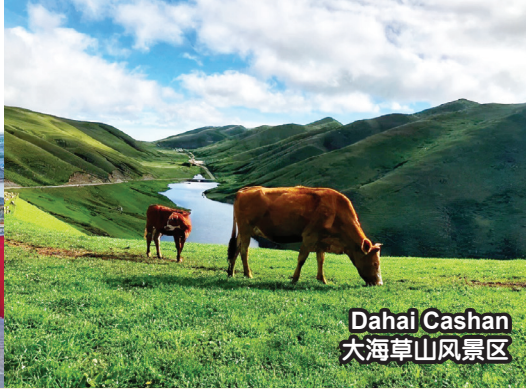
Dahai Cashan 大海草山风景区