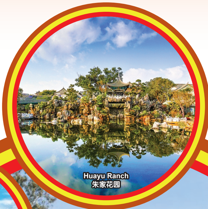
Huayu Ranch 朱家花园