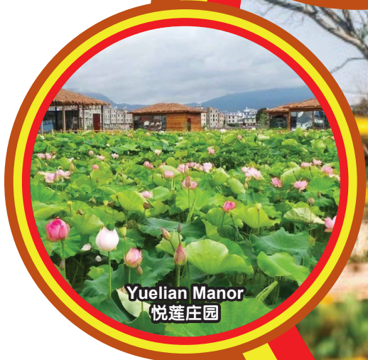
Yuelian Manor 悦莲庄园