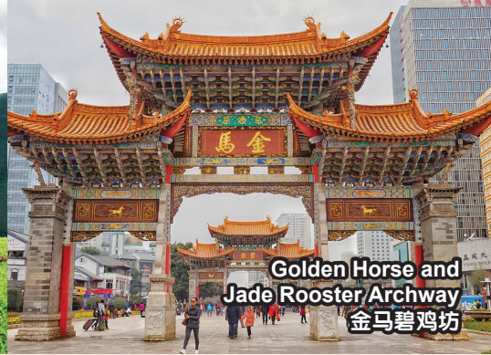
Golden Horse and Jade Rooster Archway 金马碧鸡坊