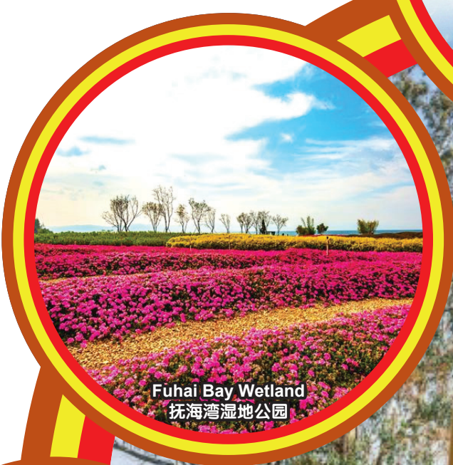
Fuhai Bay Wetland 抚海湾湿地公园