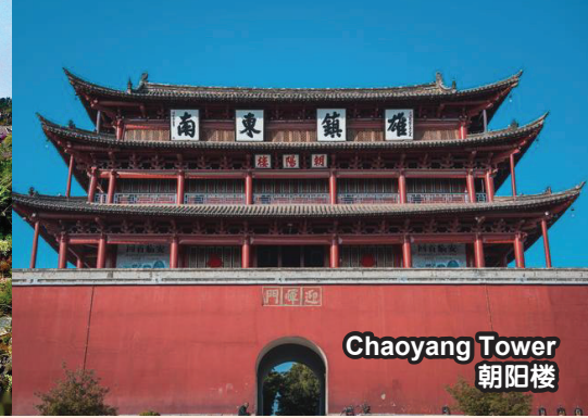
Chaoyang Tower 朝阳楼