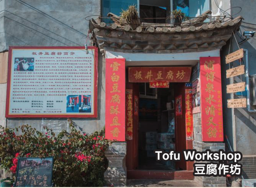
Tofu Workshop 豆腐作坊