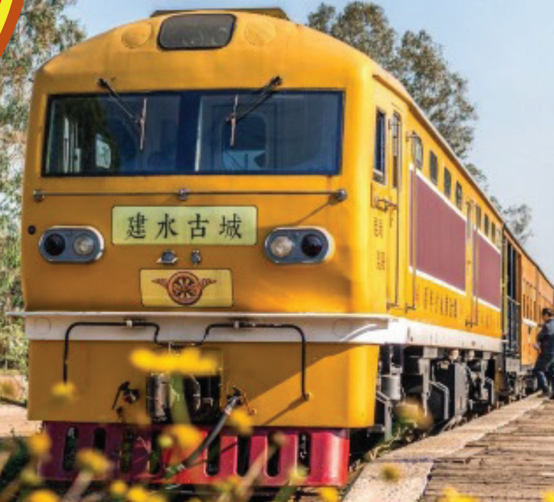
Jianshui Meter-Gauge train 建水米轨小火车

行程次序，以当地旅社安排为准。 Sequences of Itinerary are subject to local arrangement.