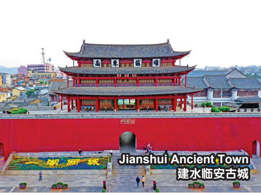
Jianshui Ancient Town 建水临安古城