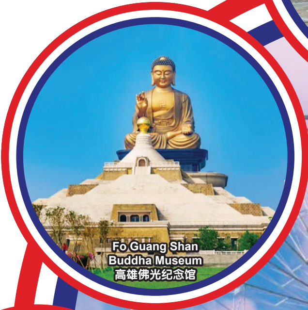
Fo Guang Shan Buddha Museum 高雄佛光纪念馆