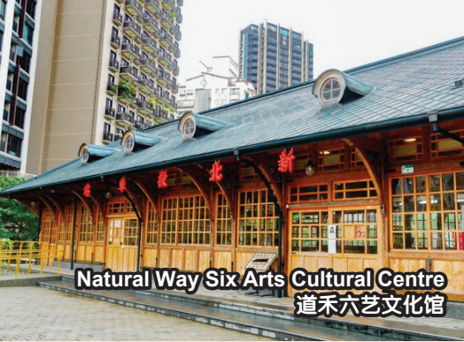
Natural Way Six Arts Cultural Centre 道禾六艺文化馆