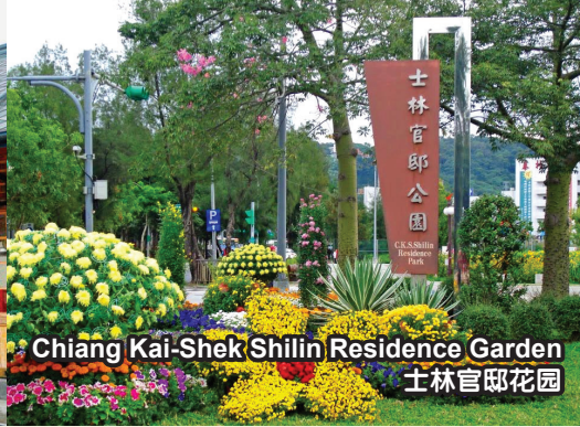
Chiang Kai-Shek Shilin Residence Garden 士林官邸花园