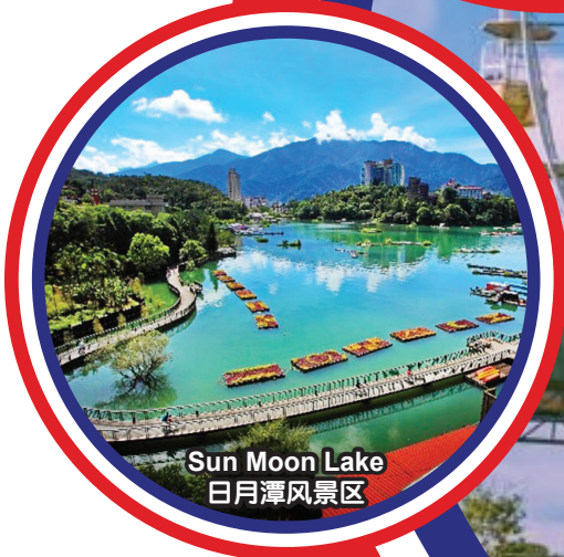
Sun Moon Lake 日月潭风景区