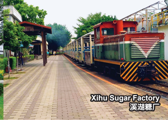
Xihu Sugar Factory 溪湖糖厂