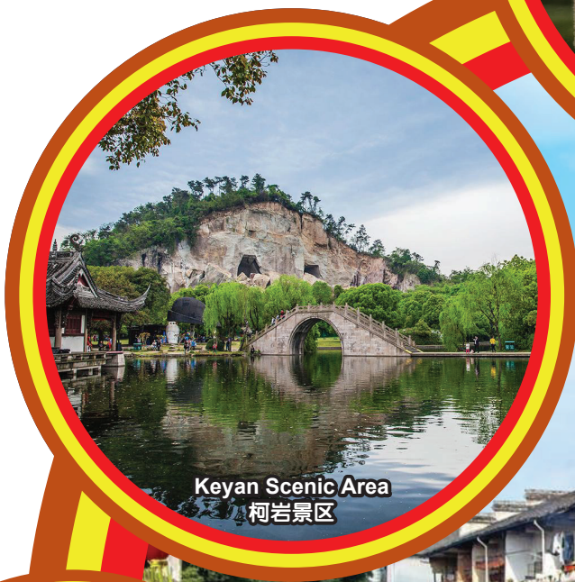
Keyan Scenic Area 柯岩景区