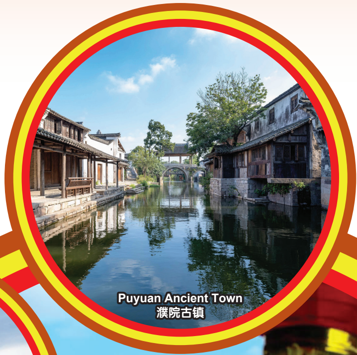
Puyuan Ancient Town 濮院古镇