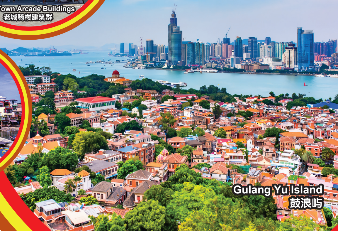
Gulang Yu Island 鼓浪屿

行程次序，以当地旅社安排为准。 Sequences of Itinerary are subject to local arrangement.