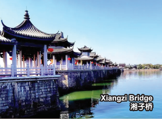
Xiangzi Bridge 湘子桥