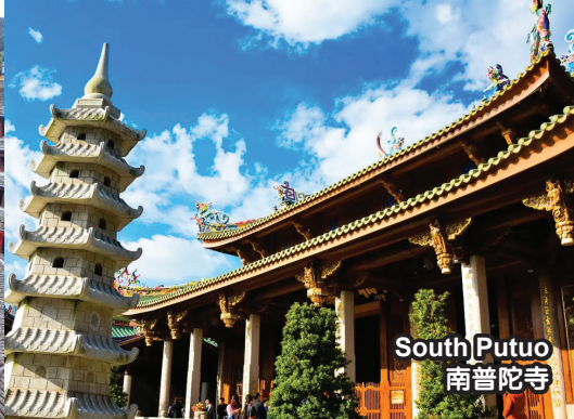
South Putuo 南普陀寺