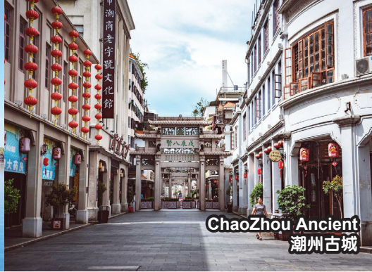
Chaozhou Ancient 潮州古城