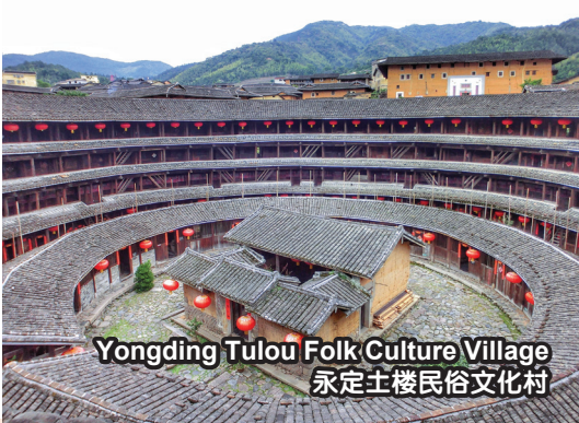
Yongding Tulou Folk Culture Village 永定土楼民俗文化村