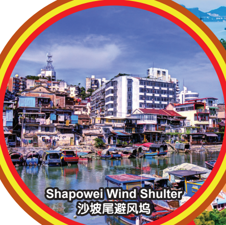
Shapowei Wind Shelter 沙坡尾避风坞

行程次序，以当地旅社安排为准。 Sequences of Itinerary are subject to local arrangement.