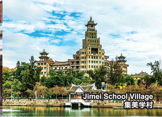
Jimei School Village 集美学村