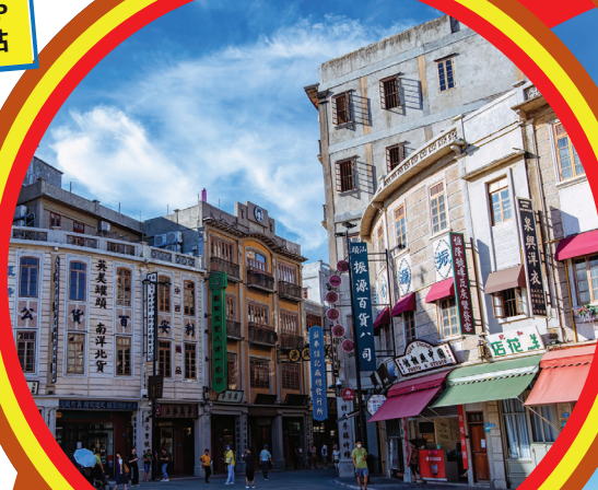
Old Town Arcade Buildings 老城骑楼建筑群