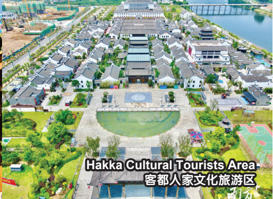
Hakka Cultural Tourists Area 客都人家文化旅游区