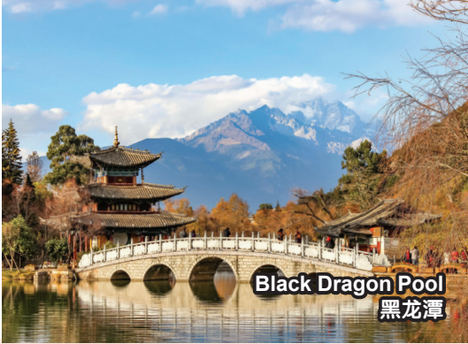
Black Dragon Pool 黑龙潭