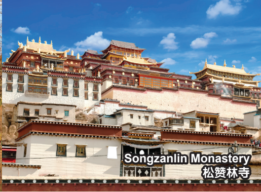
Songzanlin Monastery 松赞林寺