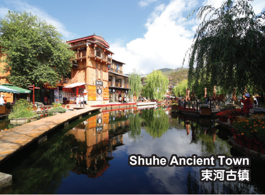
Shuhe Ancient Town 束河古镇