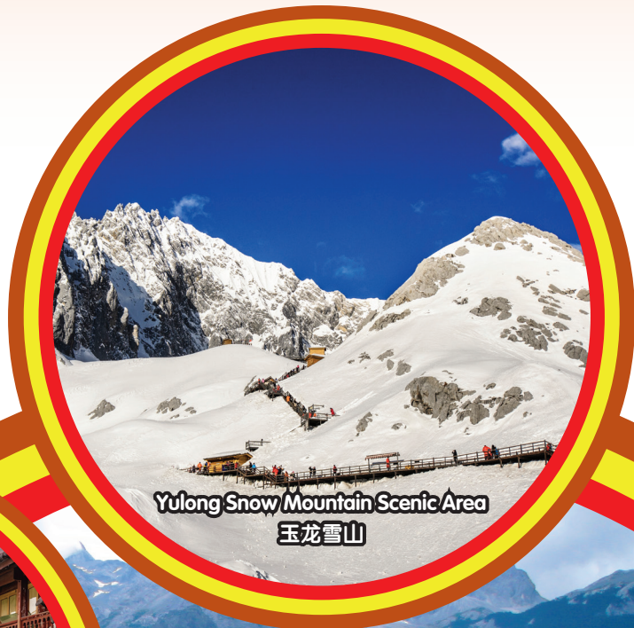
Yulong Snow Mountain Scenic Area 玉龙雪山