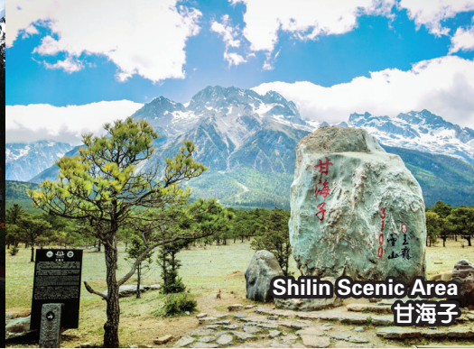
Shilin Scenic Area 甘海子