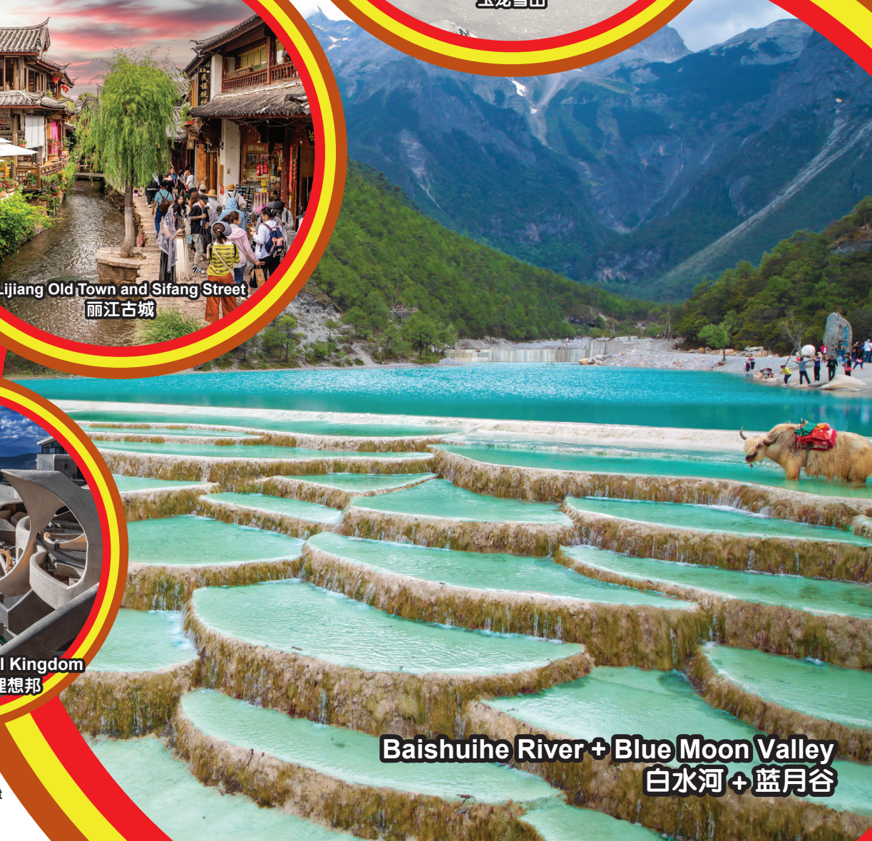
Baishuihe River + Blue Moon Valley 白水河 + 蓝月谷

行程次序, 以当地旅社安排为准。 Sequences of Itinerary are subject to local arrangement.