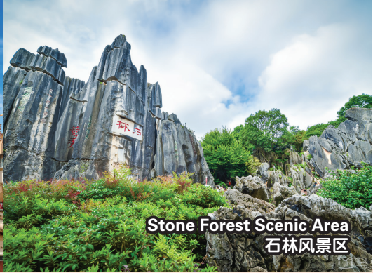
Stone Forest Scenic Area 石林风景区