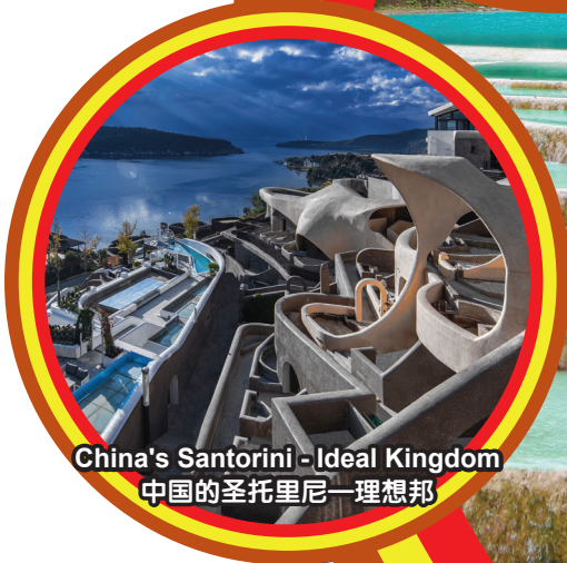
China's Santorini - Ideal Kingdom 中国的圣托里尼—理想邦

行程次序, 以当地旅社安排为准。 Sequences of Itinerary are subject to local arrangement.