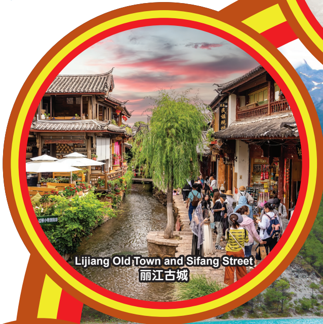
Lijiang Old Town and Sifang Street 丽江古城