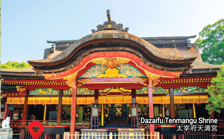
Dazaifu Tenmangu Shrine 太宰府天満宮