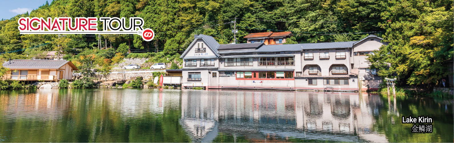
Lake Kirin 金鳞湖