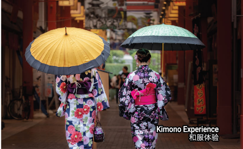
Kimono Experience 和服体验