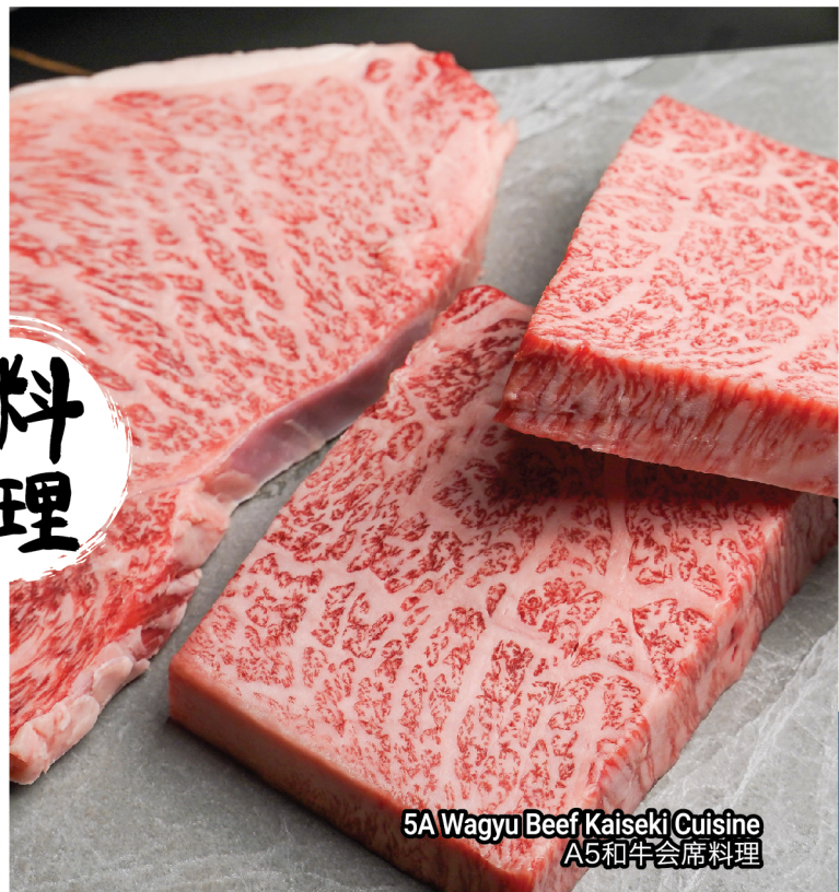
5A Wagyu Beef Kaiseki Cuisine A5和牛会席料理