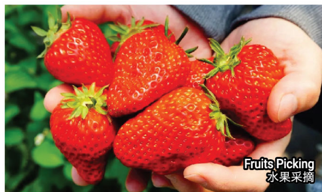
Fruits Picking 水果采摘