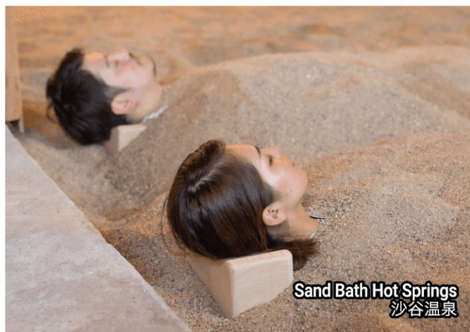
Sand Bath Hot Springs 沙谷温泉