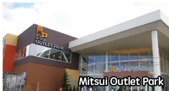
Mitsui Outlet Park