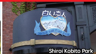
Shiroy Kobito Park