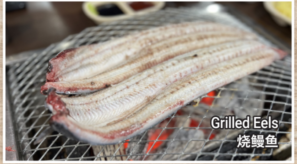
Grilled Eels 烧鳗鱼