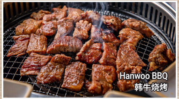
Hanwoo BBQ 韩牛烧烤