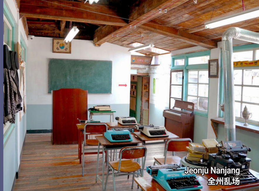
Jeonju Nanjang 全州乱场