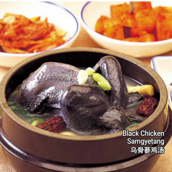
Black Chicken Samgyetang 乌骨蔘鸡汤