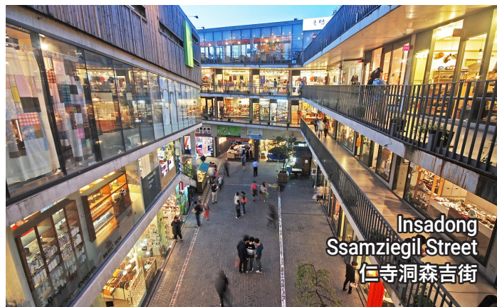
Insadong Ssamziegil Street 仁寺洞森吉街