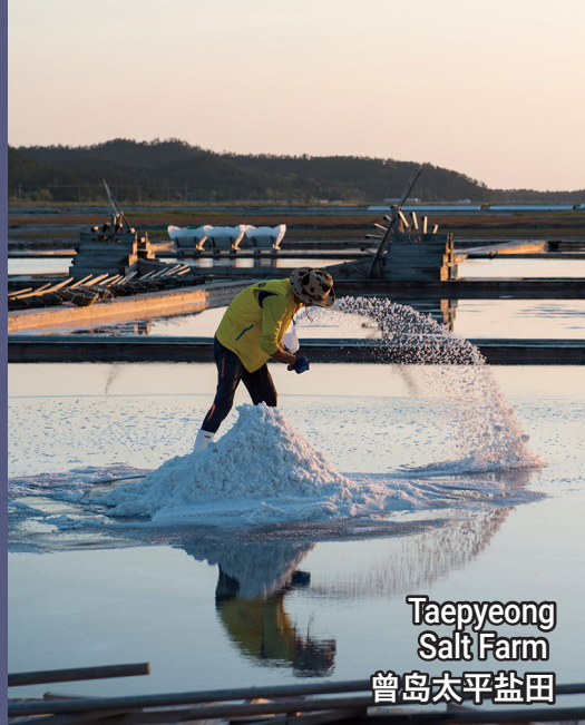
Taepyeong Salt Farm 曾岛太平盐田