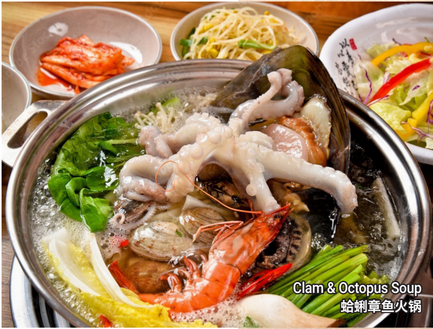
Clam & Octopus Soup 蛤蜊章鱼火锅