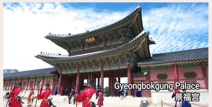
Gyeongbokgung Palace 景福宫