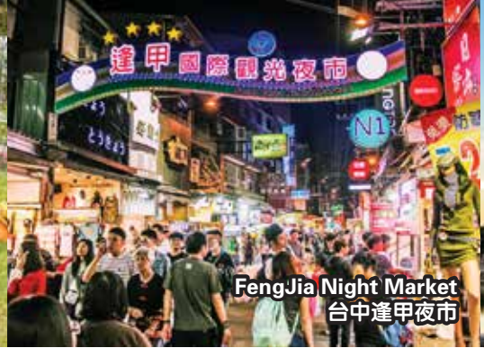
FengJia Night Market 台中逢甲夜市