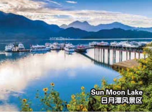
Sun Moon Lake 日月潭风景区