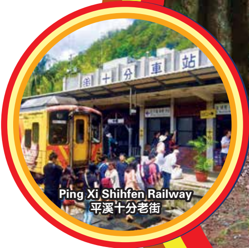
Ping Xi Shihfen Railway 平溪十分老街

Sequences of Itinerary are subject to local arrangement. 行程次序, 以当地旅社安排为准。