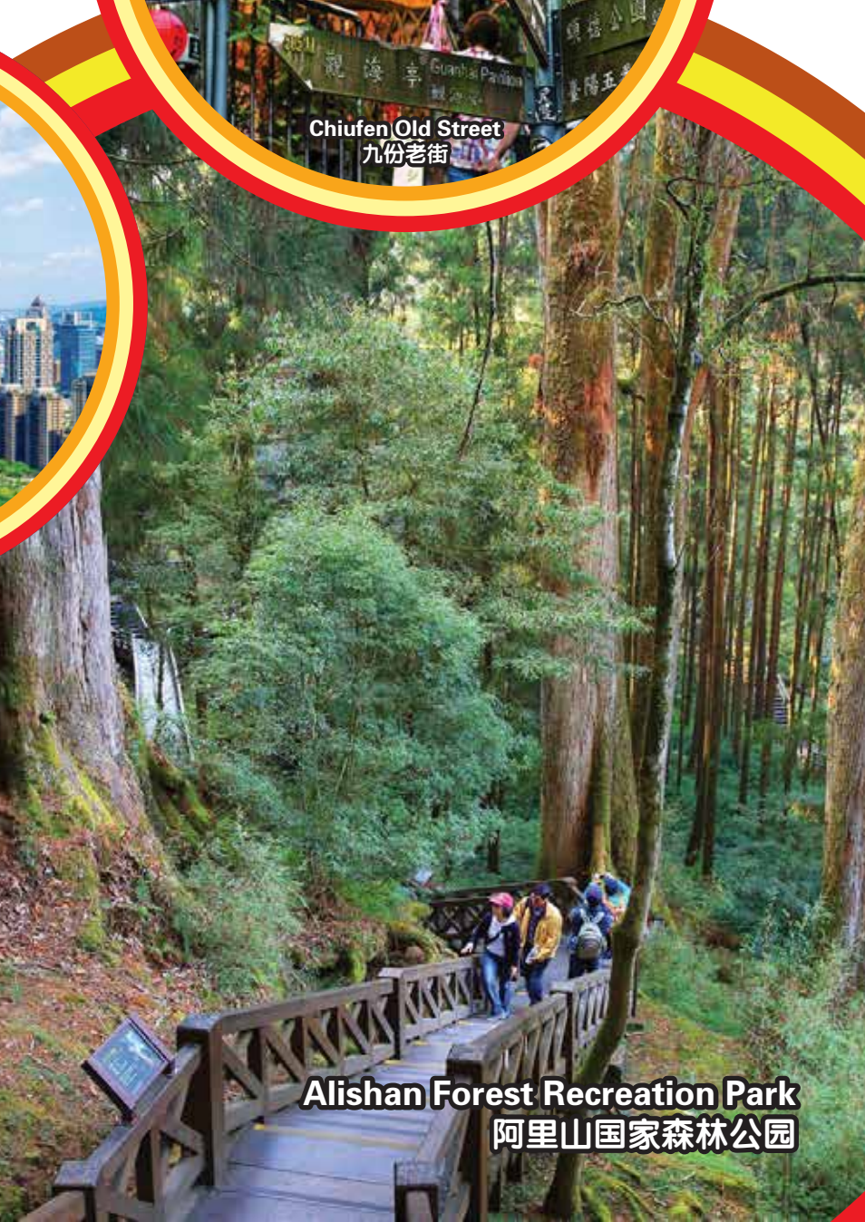
Alishan Forest Recreation Park 阿里山国家森林公园

Sequences of Itinerary are subject to local arrangement. 行程次序, 以当地旅社安排为准。