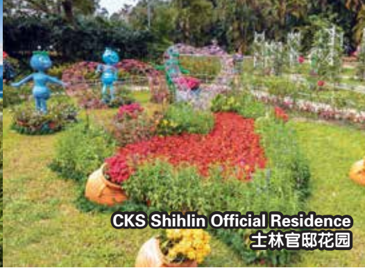
CKS Shihlin Official Residence 士林官邸花园