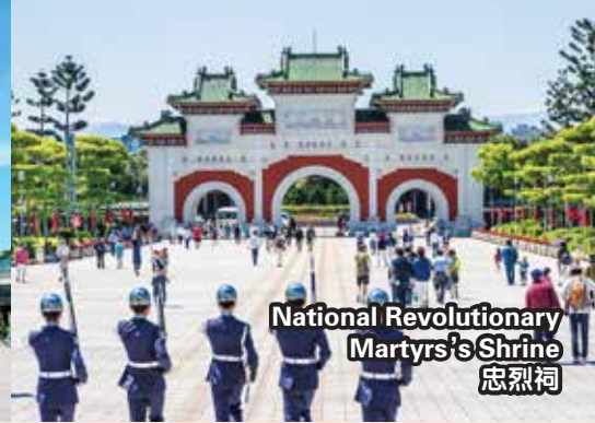
National Revolutionary Martyrs' Shrine 忠烈祠