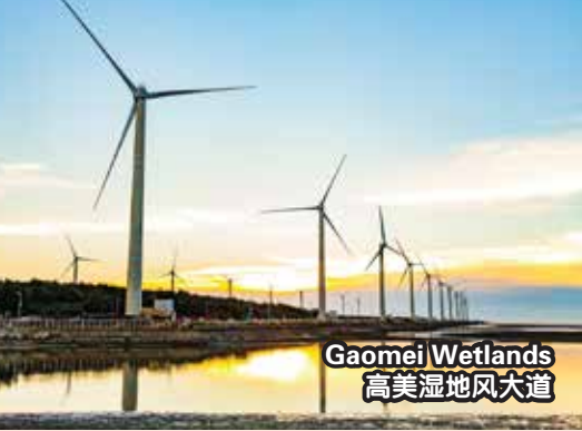
Gaomei Wetlands 高美湿地风大道