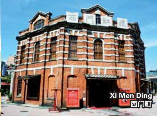
Xi Men Ding 西门町