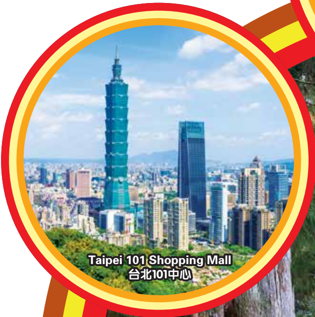
Taipei 101 Shopping Mall 台北101中心