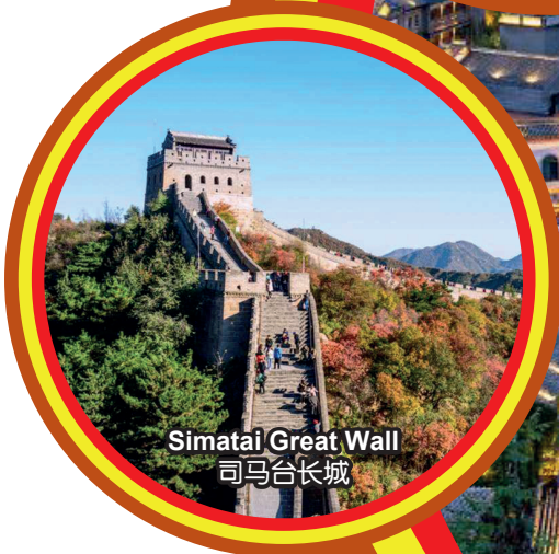
Simatai Great Wall 司马台长城