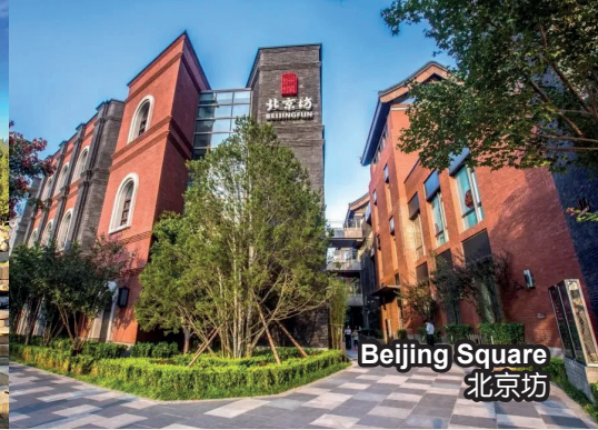
Beijing Square 北京坊