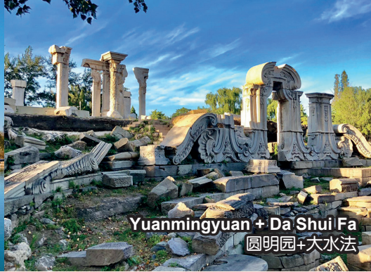
Yuanmingyuan + Da Shui Fa 圆明园+大水法