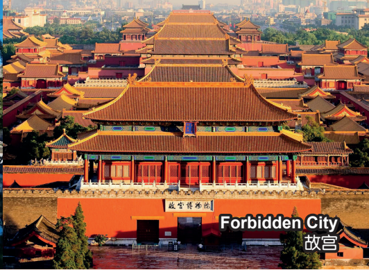
Forbidden City 故宫