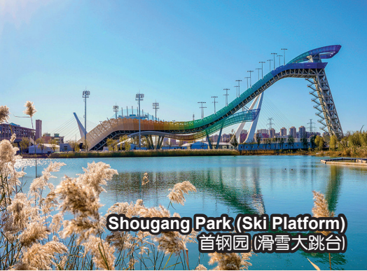
Shougang Park (Ski Platform) 首钢园 (滑雪大跳台)