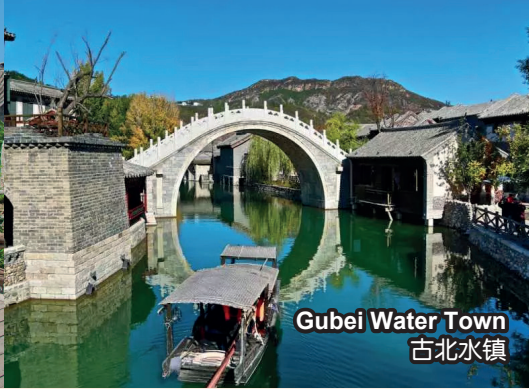
Gubei Water Town 古北水镇