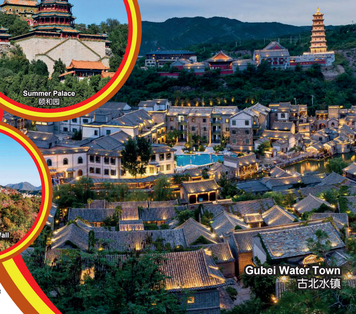
Gubei Water Town 古北水镇

行程次序，以当地旅社安排为准。 Sequences of Itinerary are subject to local arrangement.