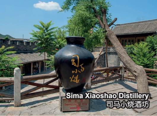
Sima Xiaoshao Distillery 司马小烧酒坊