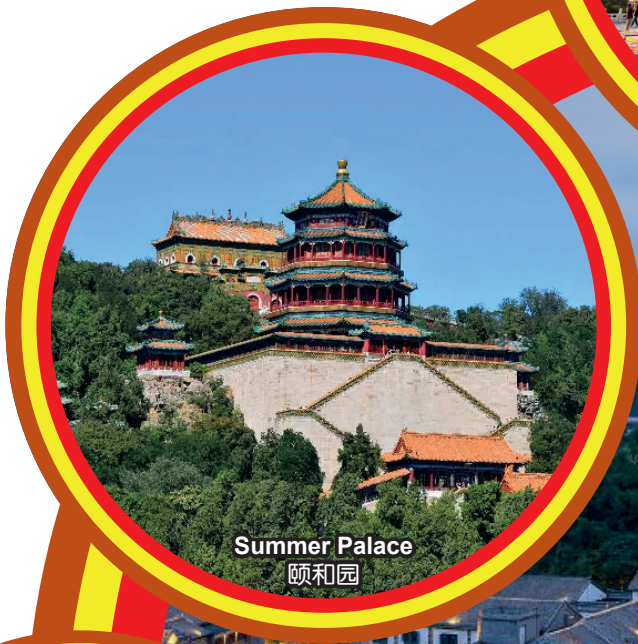
Summer Palace 颐和园