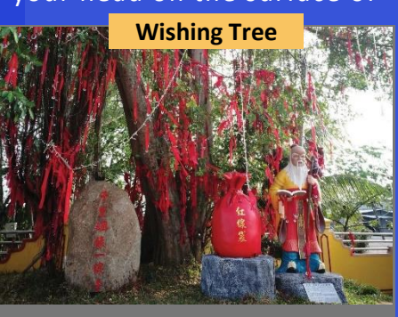
Make a wish