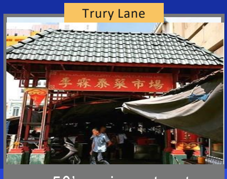
50's opium street