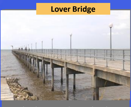
The historic lover bridge