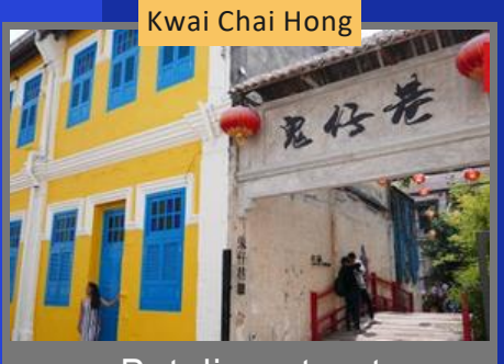
Petaling street new attraction