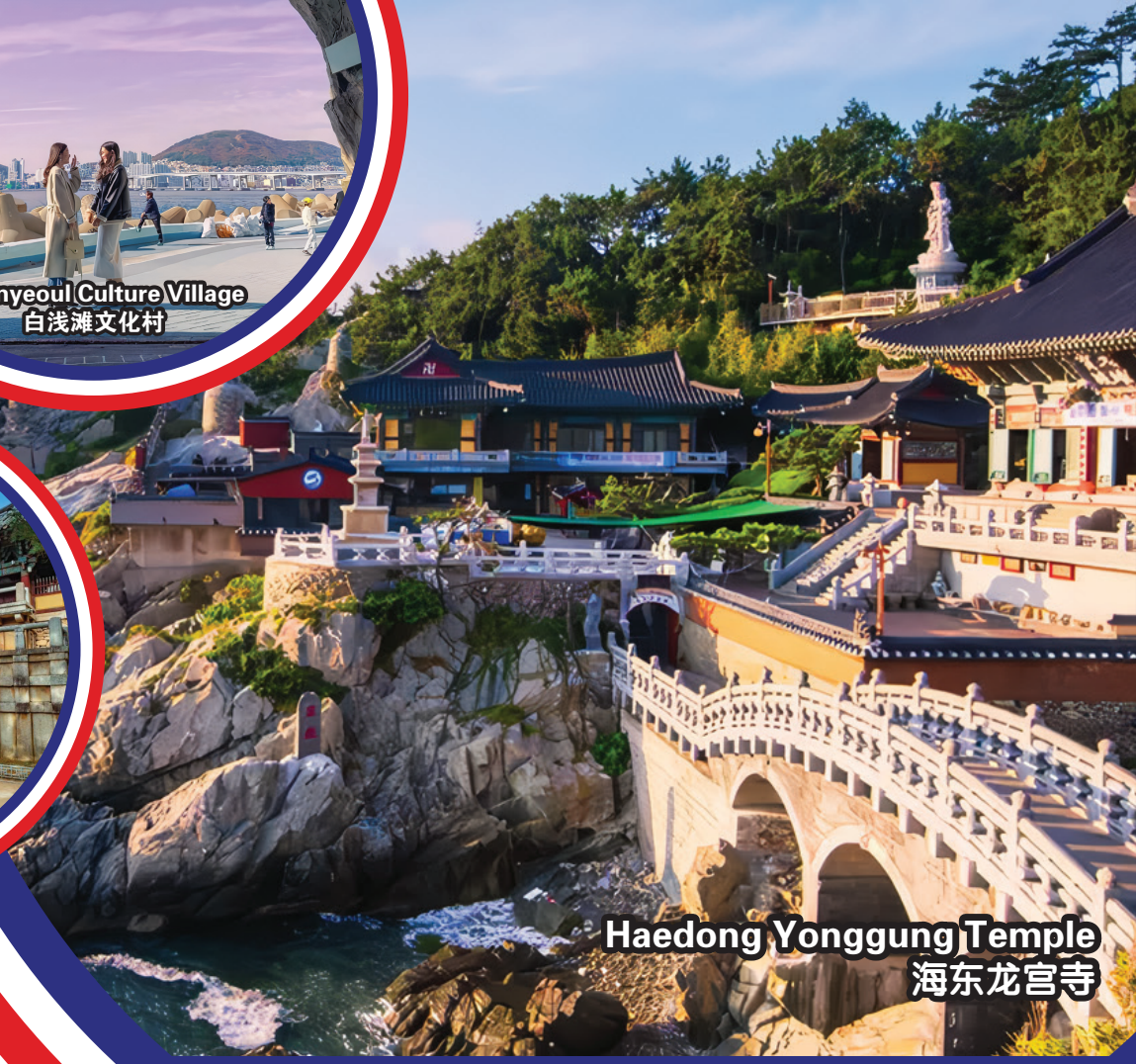
Haedong Yonggung Temple 海东龙宫寺

行程次序，以当地旅社安排为准。 Sequences of Itinerary are subject to local arrangement.