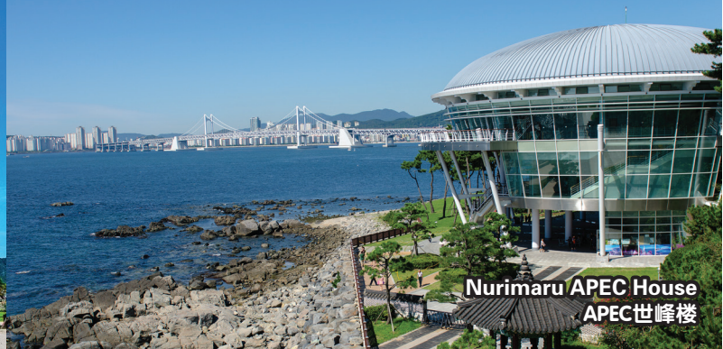
Nurimaru APEC House APEC世峰楼