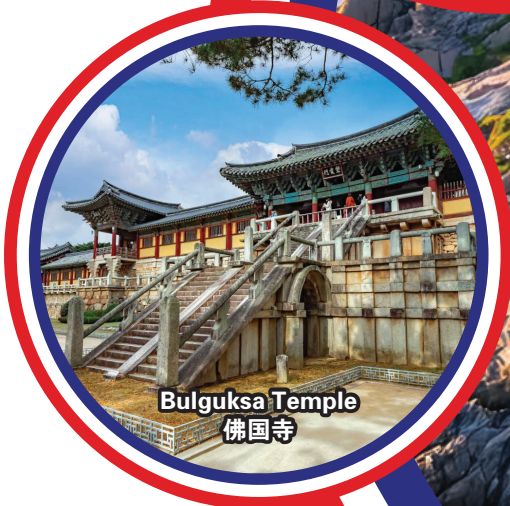
Bulguksa Temple 佛国寺

行程次序，以当地旅社安排为准。 Sequences of Itinerary are subject to local arrangement.