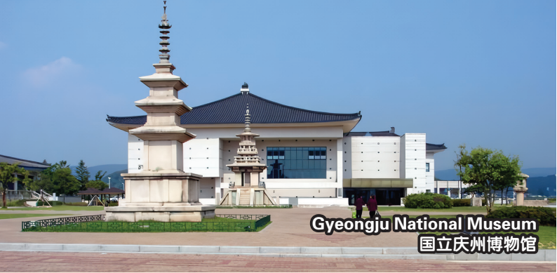
Gyeongju National Museum 国立庆州博物馆