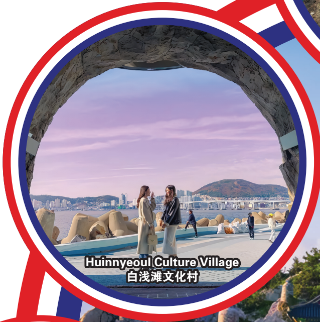
Huinyeoul Culture Village 白浅滩文化村