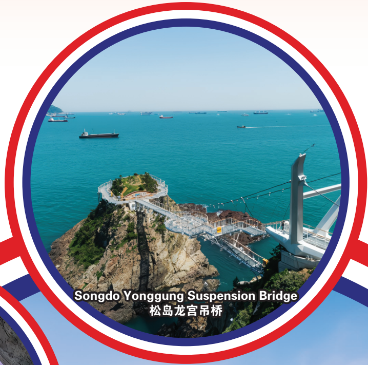
Songdo Yonggung Suspension Bridge 松岛龙宫吊桥