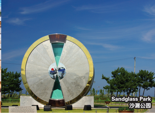
Sandglass Park 沙漏公园