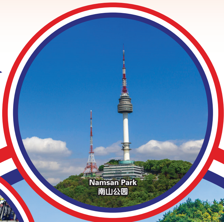
Namsan Park 南山公园