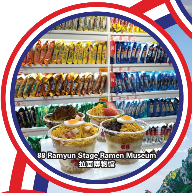
88 Ramyun Stage Ramen Museum 拉面博物馆