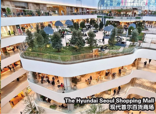
The Hyundai Seoul Shopping Mall 现代首尔百货商场