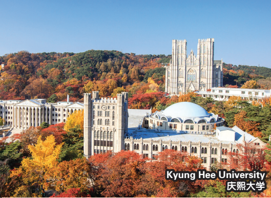
Kyung Hee University 庆熙大学