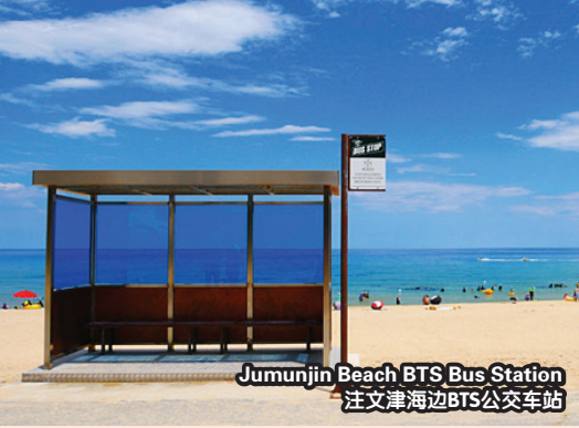
Jumunjin Beach BTS Bus Station 注文津海边BTS公交车站