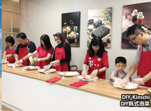
DIY Kimchi DIY韩式泡菜