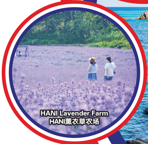
HANI Lavender Farm HANI薰衣草农场

行程次序，以当地旅社安排为准。 Sequences of Itinerary are subject to local arrangement.