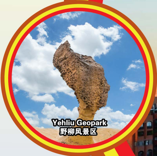
Yehliu Geopark 野柳风景区