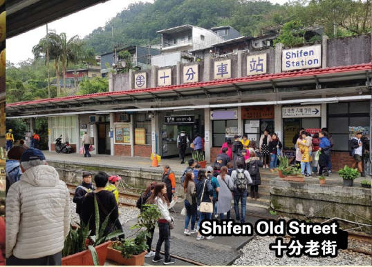
Shifen Old Street 十分老街