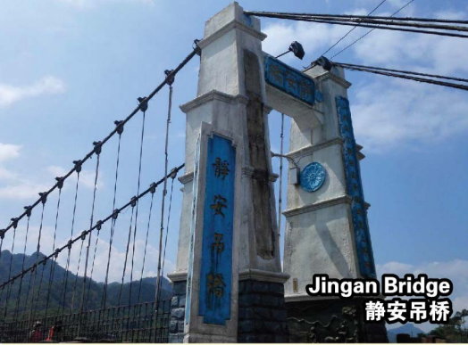
Jingan Bridge 静安吊桥