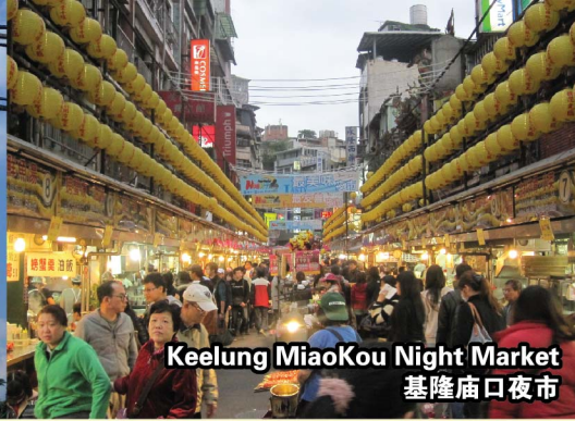
Keelung MiaoKou Night Market 基隆庙口夜市