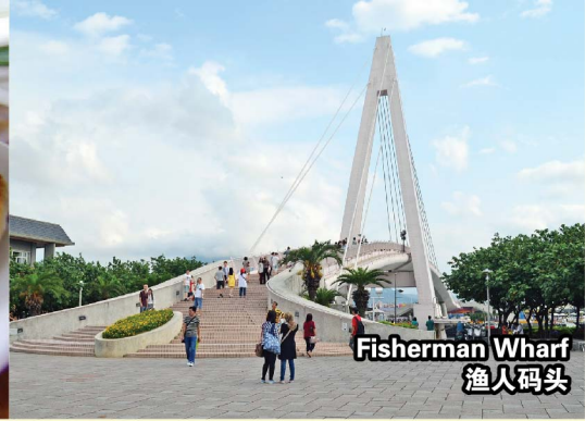
Fisherman Wharf 渔人码头