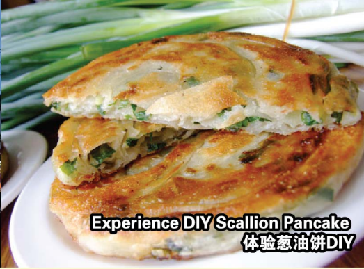
Experience DIY Scallion Pancake 体验葱油饼DIY