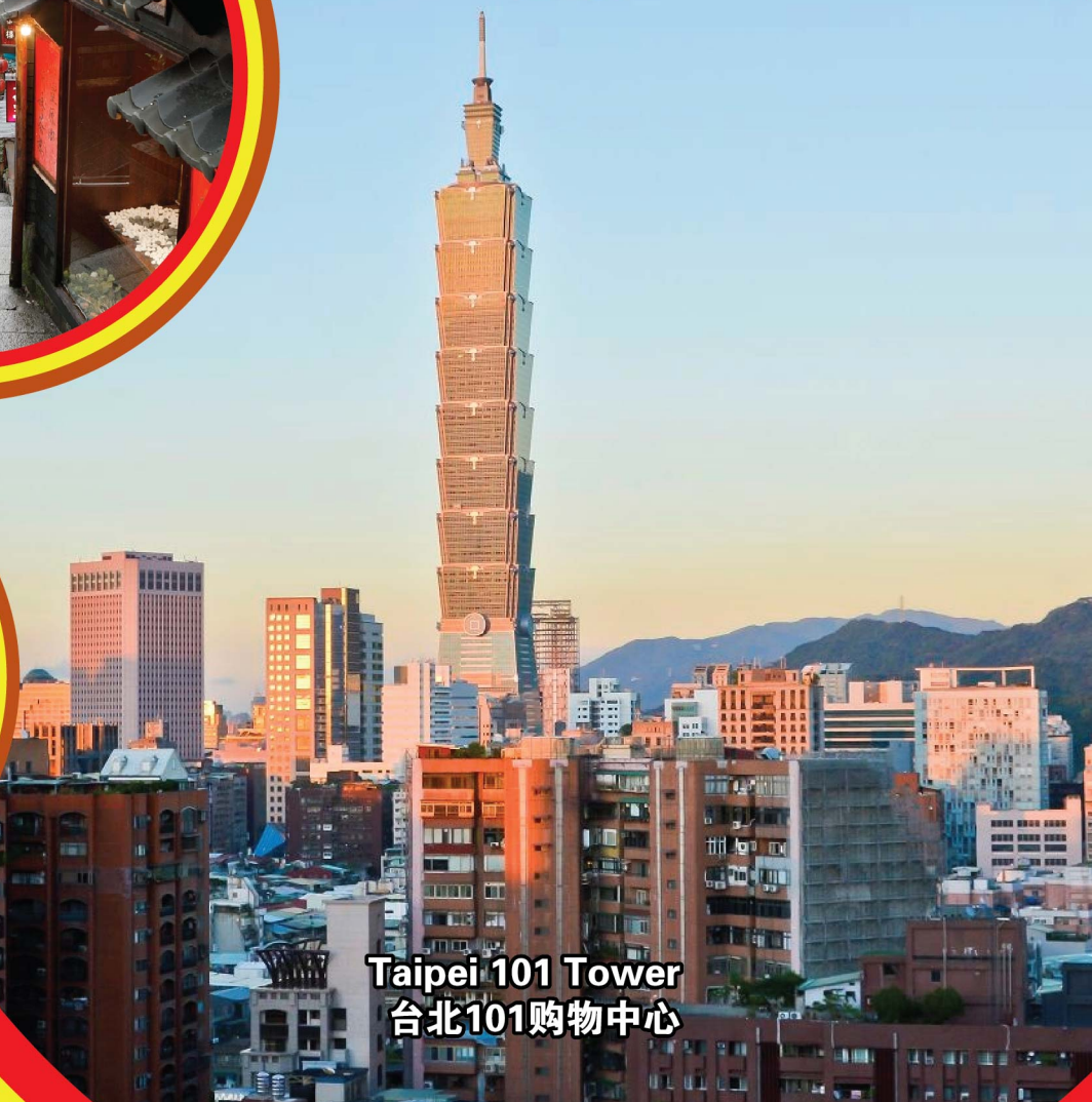
Taipei 101 Tower 台北101购物中心

行程次序，以当地旅社安排为准。 Sequences of Itinerary are subject to local arrangement.