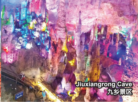
Jiuxiangrong Cave 九乡景区