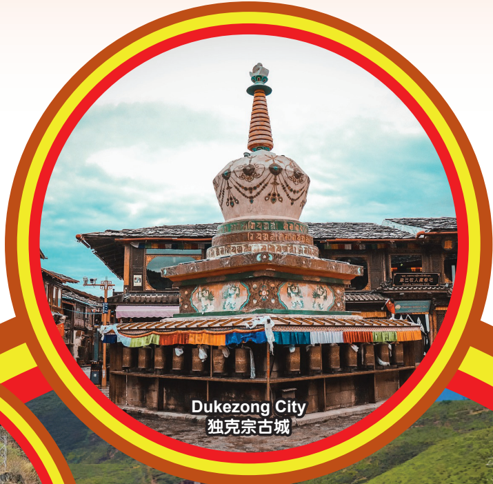
Dukezong City 独克宗古城