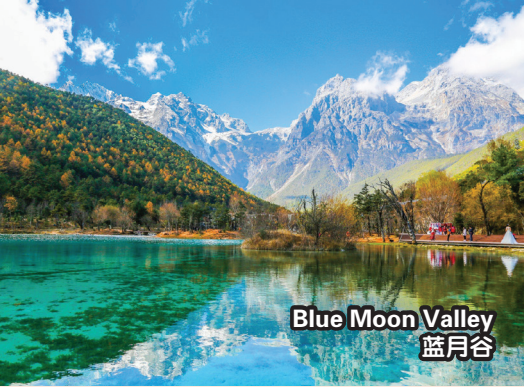
Blue Moon Valley 蓝月谷