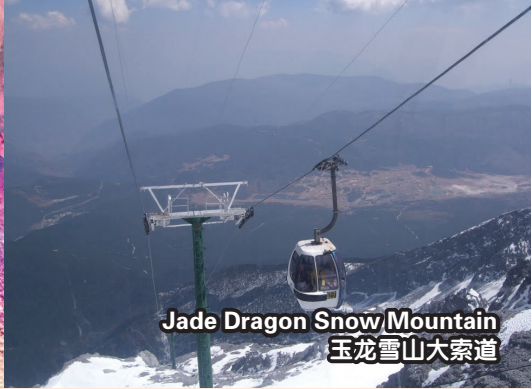
Jade Dragon Snow Mountain 玉龙雪山大索道