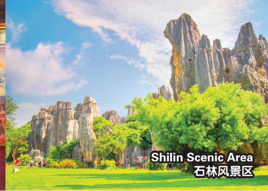
Shilin Scenic Area 石林风景区