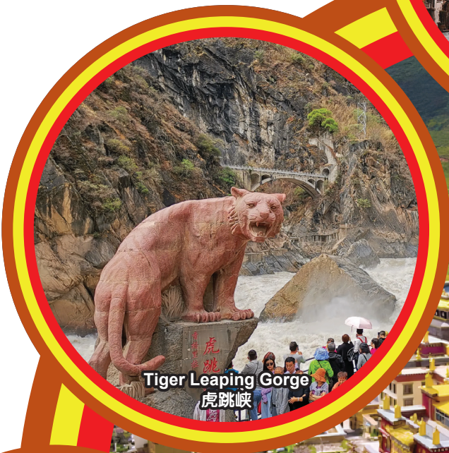
Tiger Leaping Gorge 虎跳峡