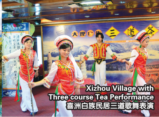
Xizhou Village with Three course Tea Performance 喜洲白族民居三道歌舞表演