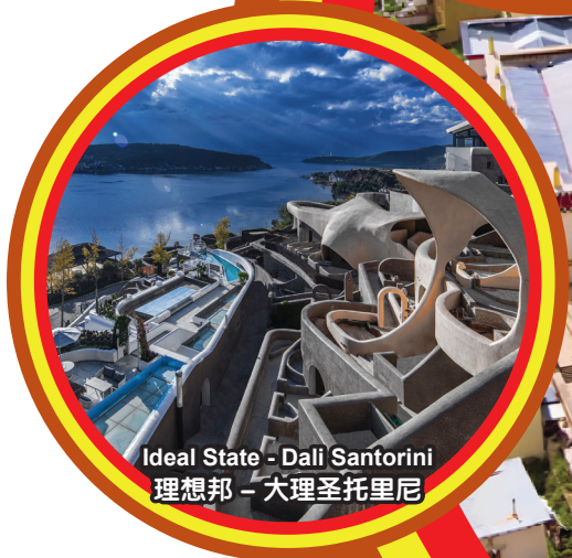
Ideal State - Dali Santorini 理想邦 - 大理圣托里尼