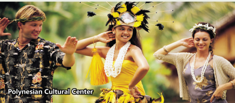
Polynesian Cultural Center