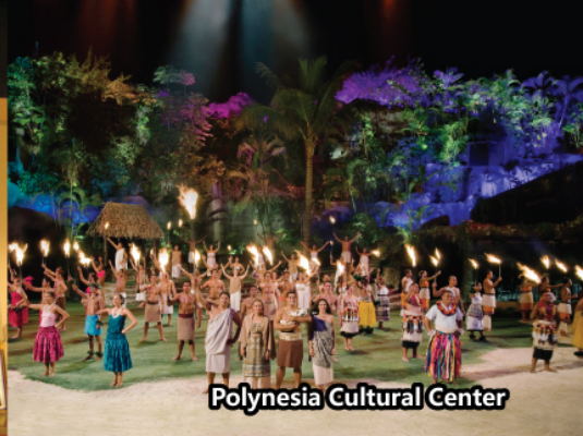
Polynesia Cultural Center