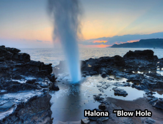
Halona "Blow Hole"