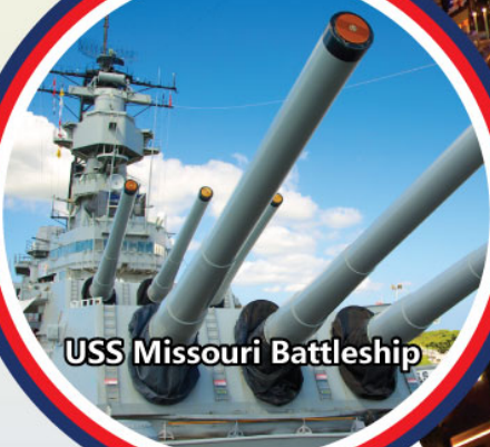
USS Missouri Battleship