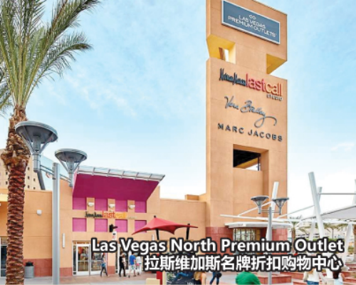
Las Vegas North Premium Outlet 拉斯维加斯名牌折扣购物中心