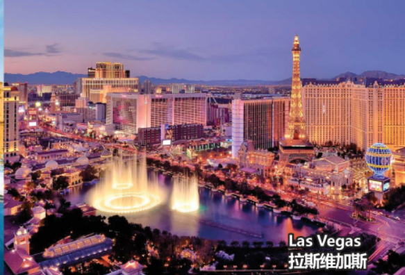
Las Vegas 拉斯维加斯