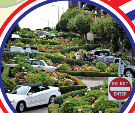
Lombard Street 九曲花街