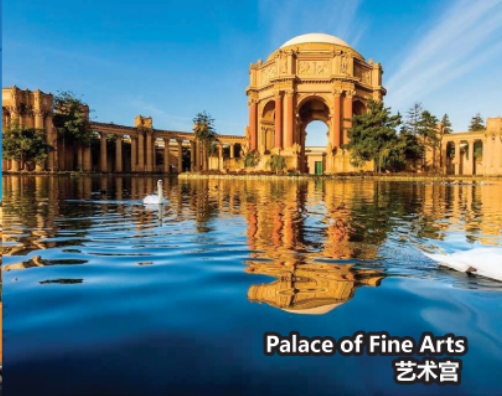
Palace of Fine Arts 艺术宫