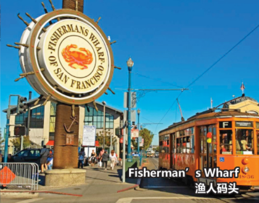
Fisherman's Wharf 渔人码头