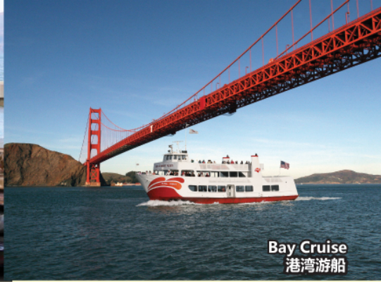
Bay Cruise 港湾游船