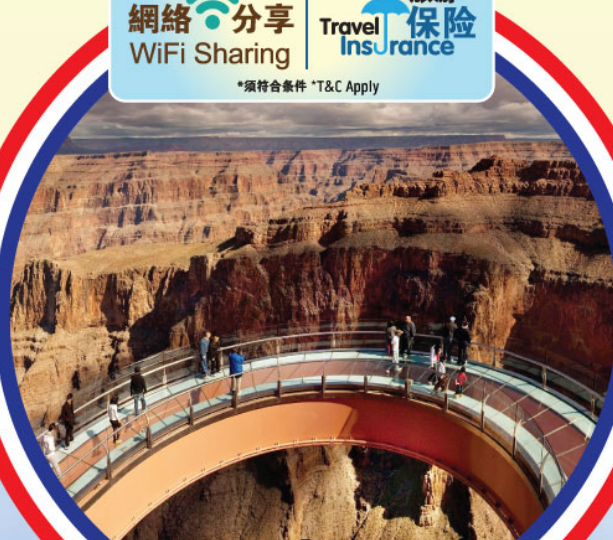
Grand Canyon 大峡谷