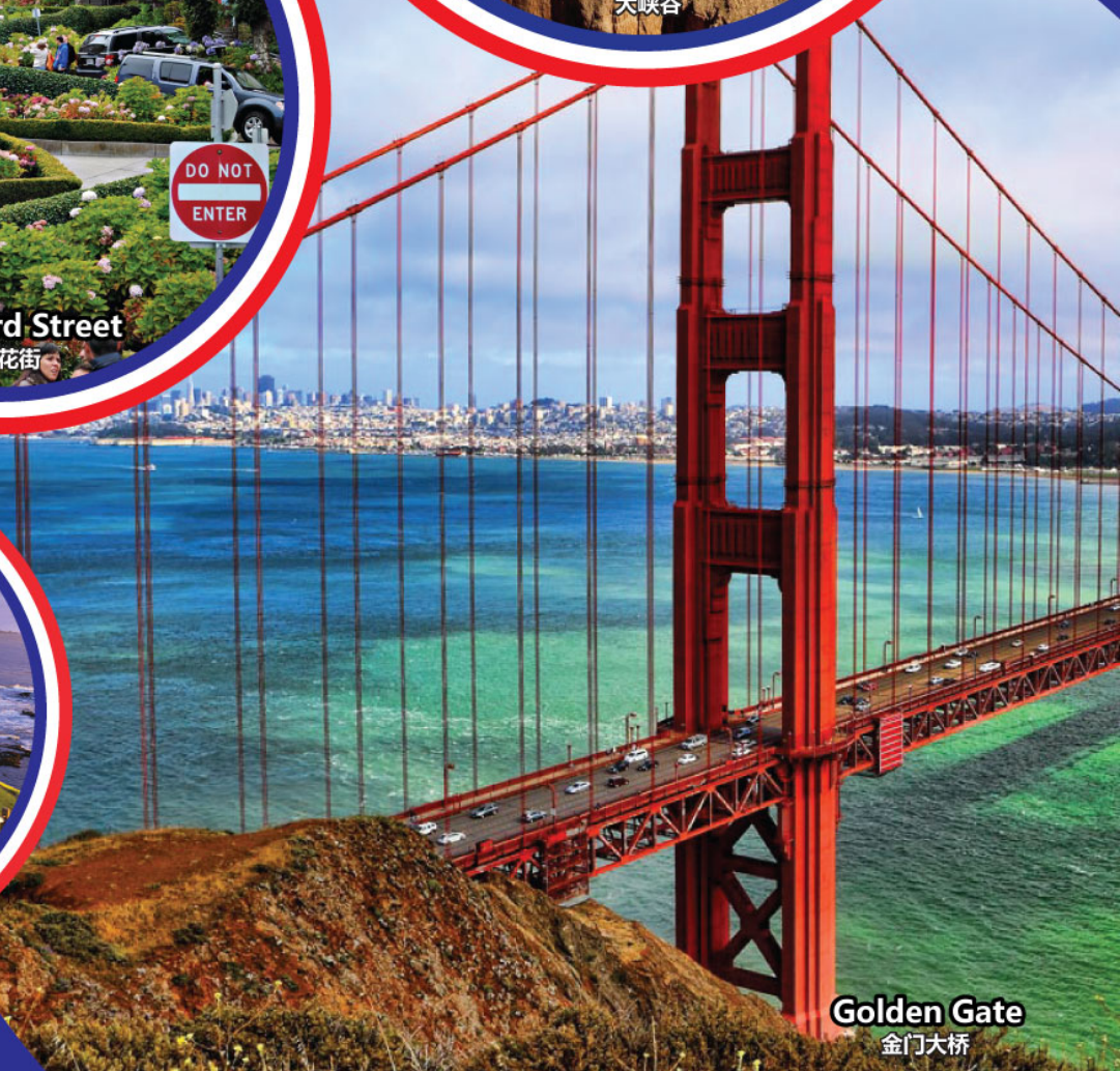
Golden Gate 金门大桥