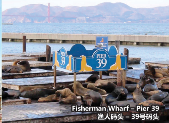
Fisherman Wharf – Pier 39 渔人码头 – 39号码头