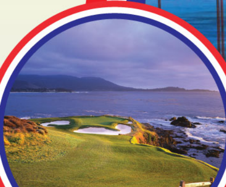
Pebble Beach 17英里-圆石滩