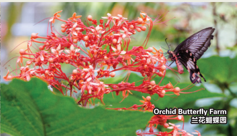
Orchid Butterfly Farm 兰花蝴蝶园

自费项目: • 入境缅甸 [ THB 1500 / 每人 ] • 乘船游缆老挝 [ THB 500 / 每人 ]