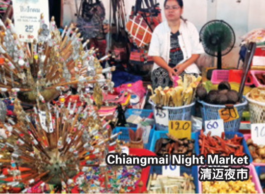
Chiangmai Night Market 清迈夜市