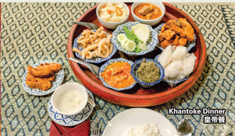
Khantoke Dinner 皇帝餐