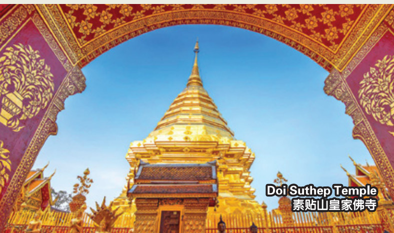
Doi Suthep Temple 素贴山皇家佛寺

Optional Tour: Enter to Burma [THB 1500 / Pax ] / Boat Trip to Laos [THB 500 / Pax ]