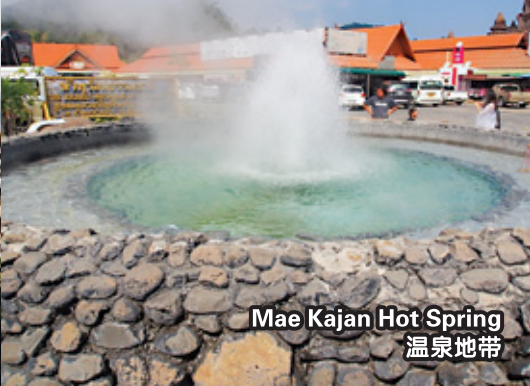
Mae Kajan Hot Spring 温泉地带