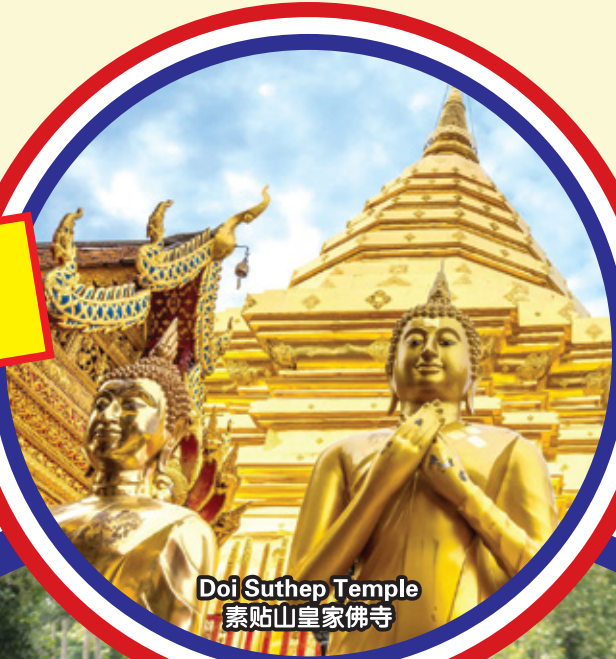
Doi Suthep Temple 素贴山皇家佛寺