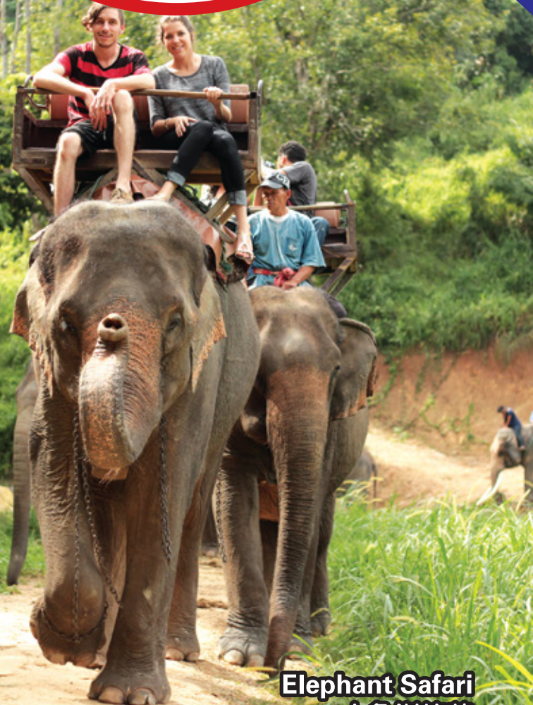
Elephant Safari 大象训练营

行程次序, 以当地旅社安排为准。 Sequences of Itinerary are subject to local arrangement.