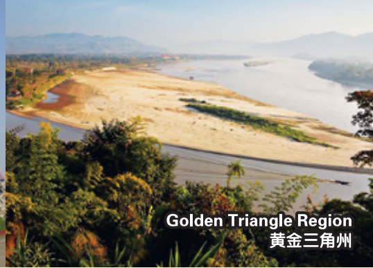
Golden Triangle Region 黄金三角州