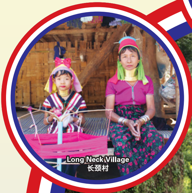
Long Neck Village 长颈村