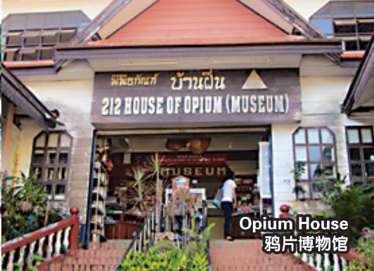
Opium House 鸦片博物馆