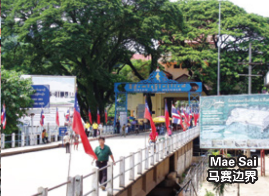
Mae Sai 马赛边界