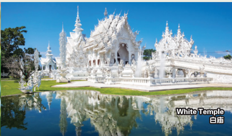
White Temple 白庙