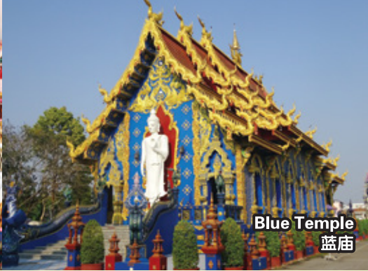
Blue Temple 蓝庙