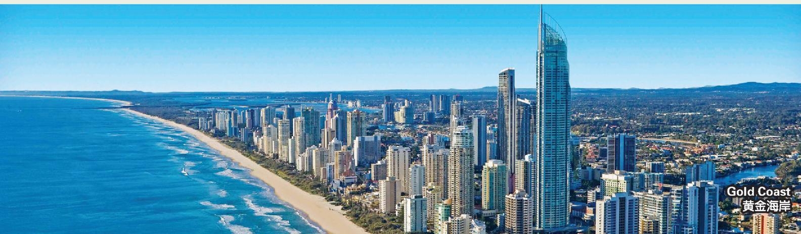
Gold Coast 黄金海岸