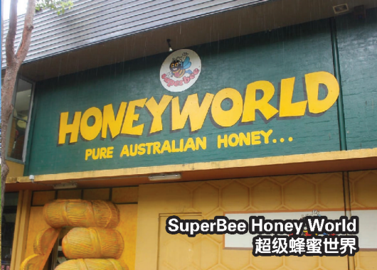
SuperBee Honey World 超级蜂蜜世界