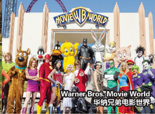
Warner Bros. Movie World 华纳兄弟电影世界