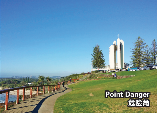
Point Danger 危险角