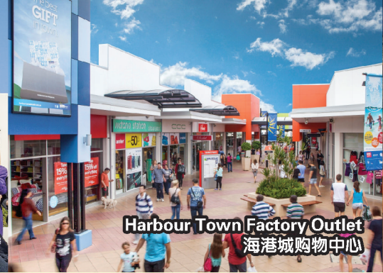
Harbour Town Factory Outlet 海港城购物中心