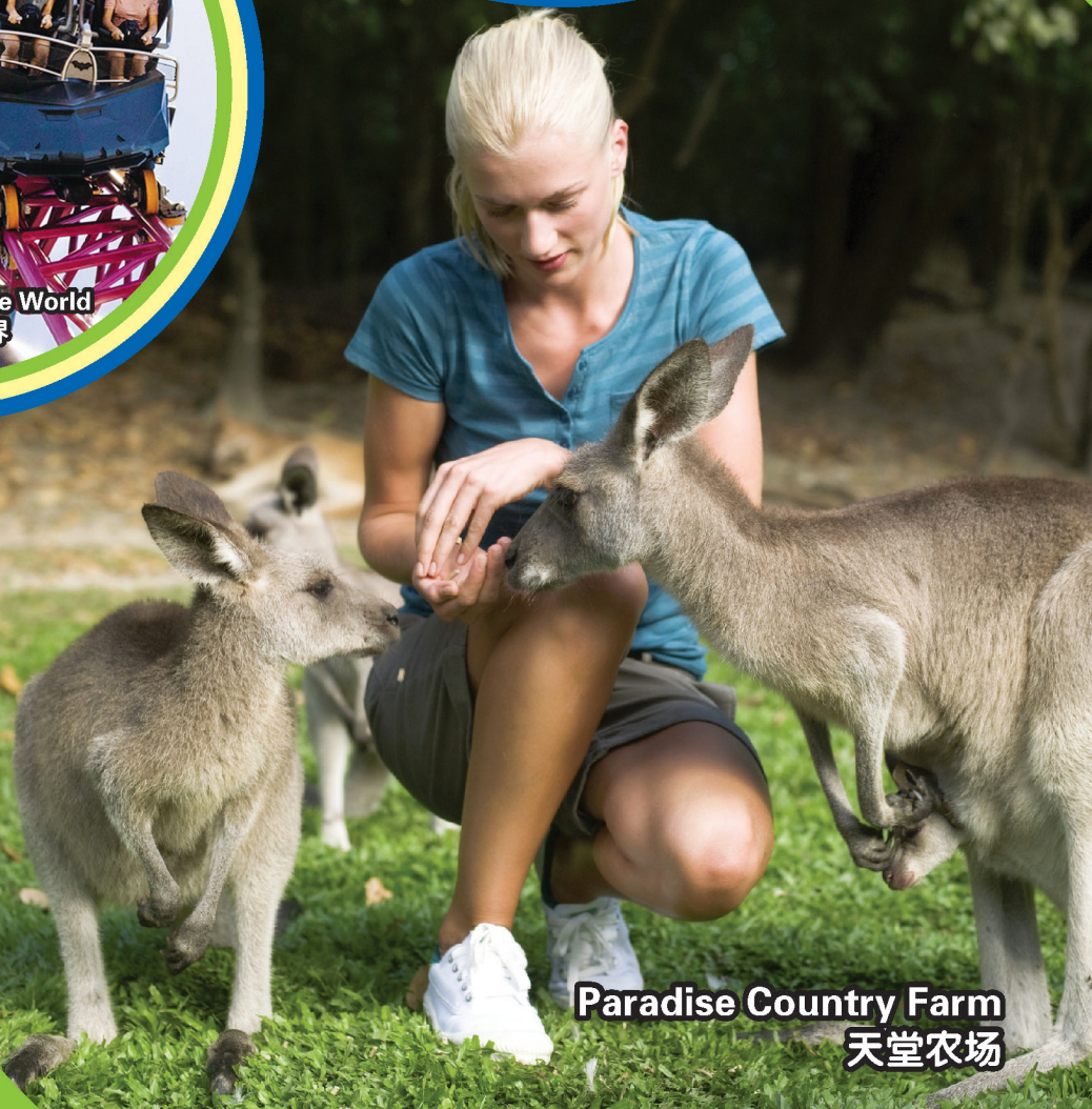
Paradise Country Farm 天堂农场

行程次序，以当地旅社安排为准。 Sequences of Itinerary are subject to local arrangement.