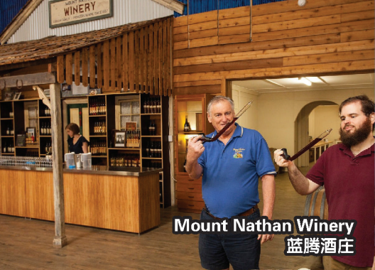
Mount Nathan Winery 蓝腾酒庄