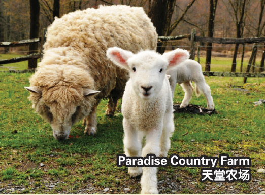
Paradise Country Farm 天堂农场