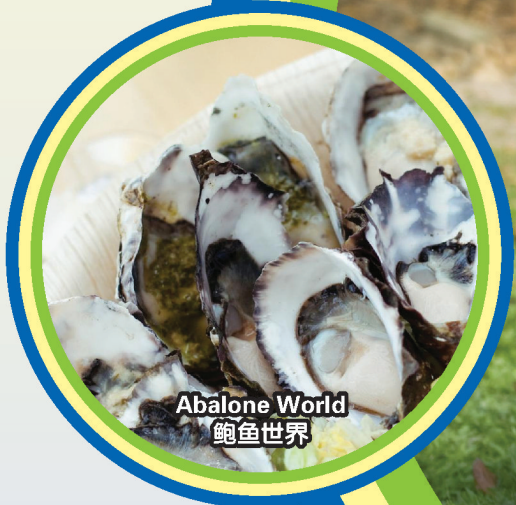
Abalone World 鲍鱼世界