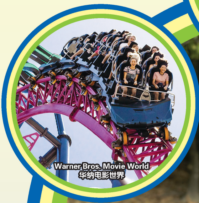
Warner Bros. Movie World 华纳电影世界