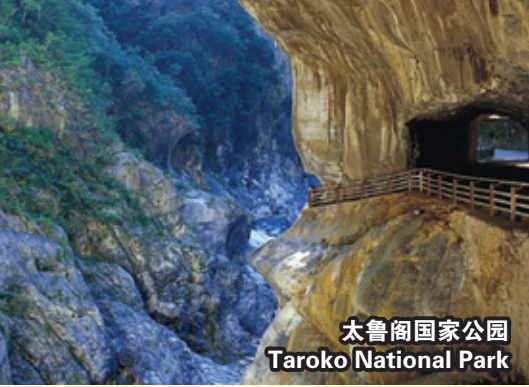
太鲁阁国家公园 Taroko National Park