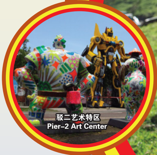
驳二艺术特区 Pier-2 Art Center