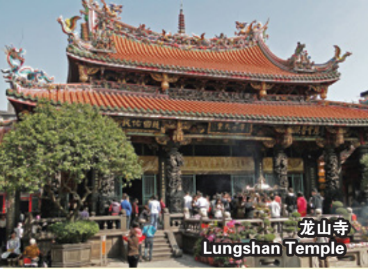
龙山寺 Lungshan Temple