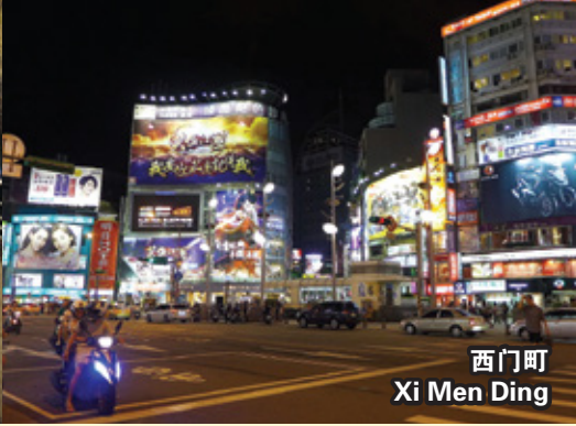
西门町 Xi Men Ding