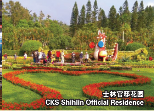
士林官邸花园 CKS Shihlin Official Residence