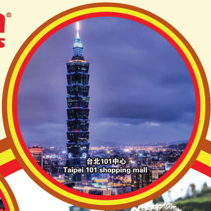
台北101中心 Taipei 101 shopping mall