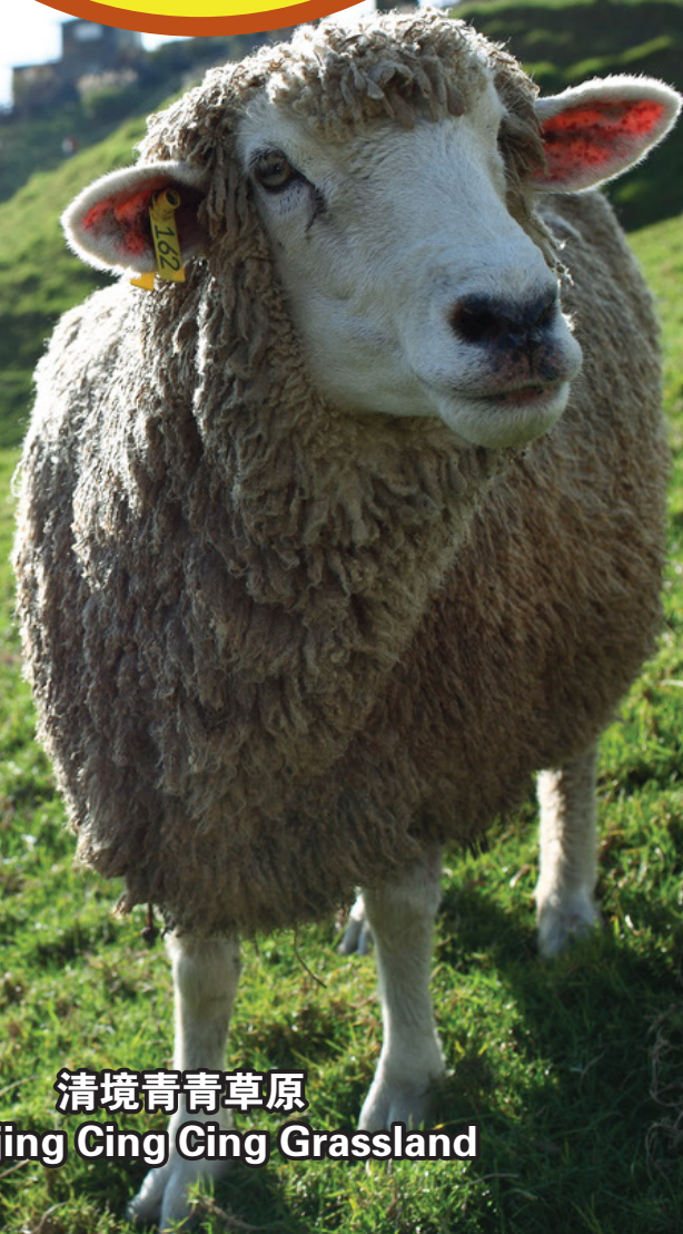
清境青青草原 Qingjing Cing Cing Grassland

行程次序·以当地旅社安排为准。 Sequences of Itinerary are subject to local arrangement.