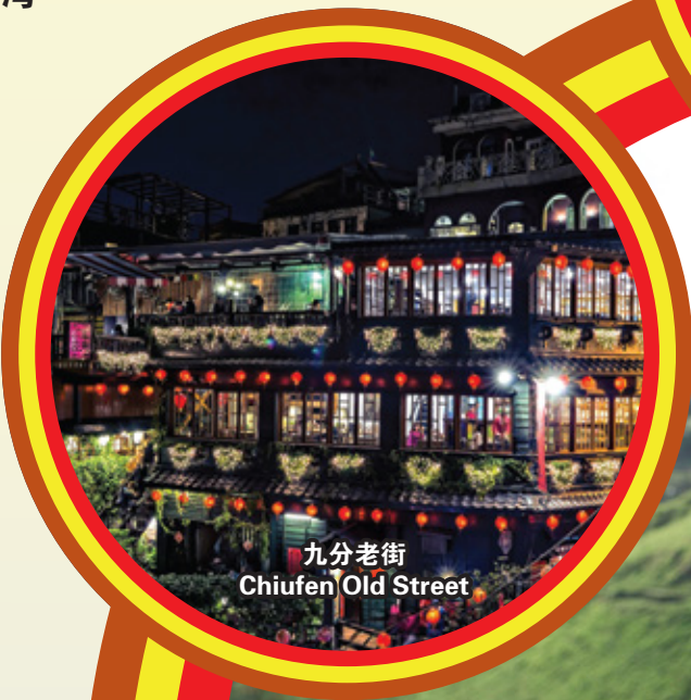
九分老街 Chiufen Old Street