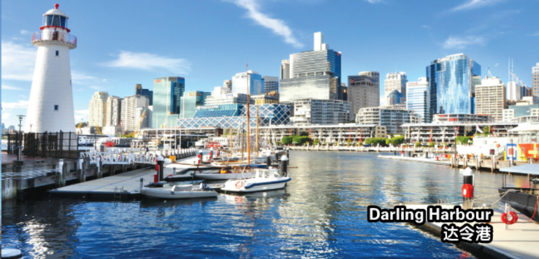
Darling Harbour 达令港