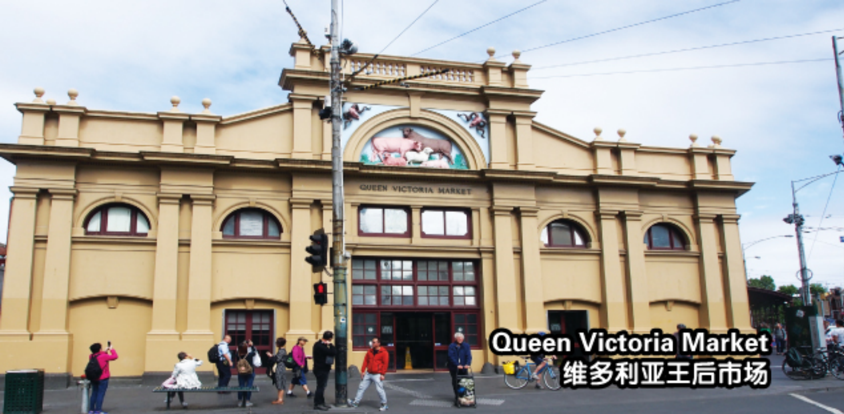
Queen Victoria Market 维多利亚王后市场