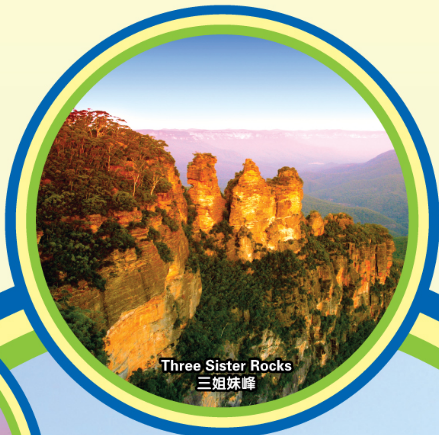
Three Sister Rocks 三姐妹峰