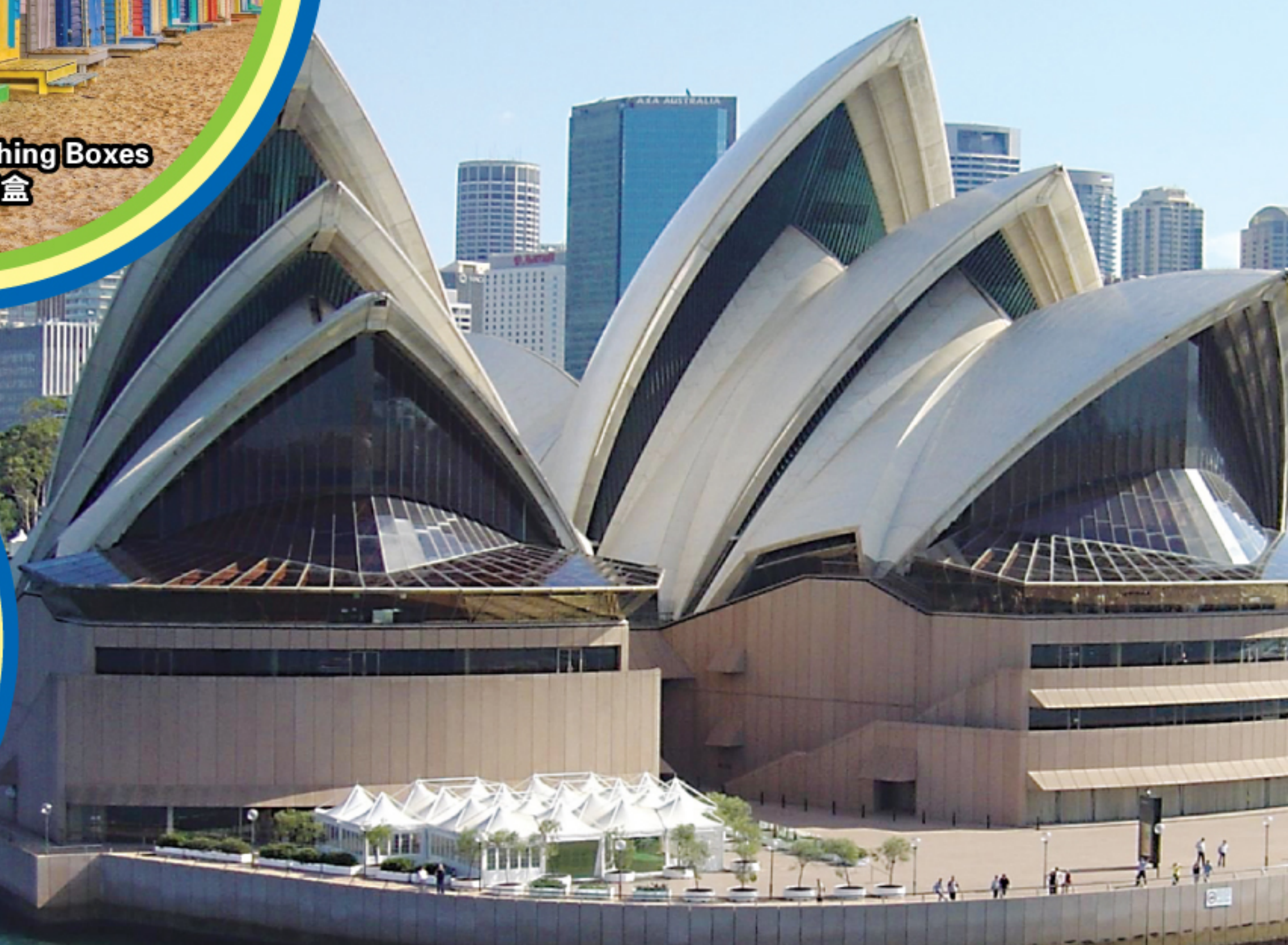
Sydney Opera House 悉尼歌剧院

行程次序，以当地旅社安排为准。 Sequences of Itinerary are subject to local arrangement.