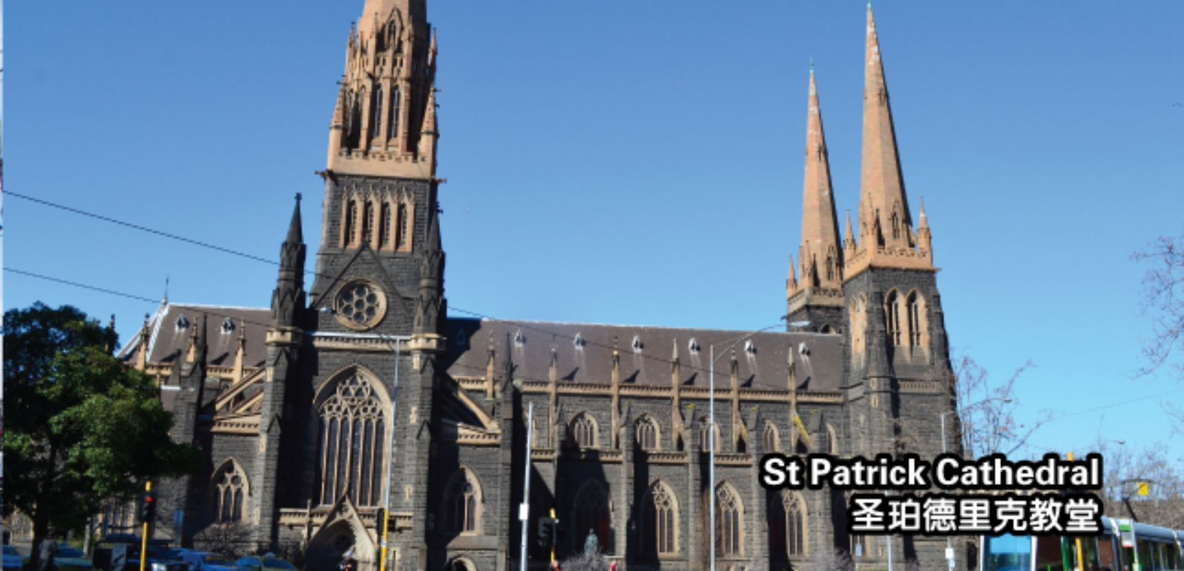
St Patrick Cathedral 圣珀德里克教堂