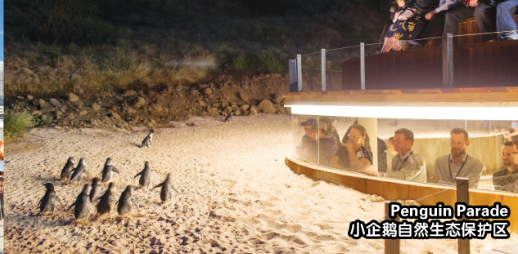
Penguin Parade 小企鹅自然保护区