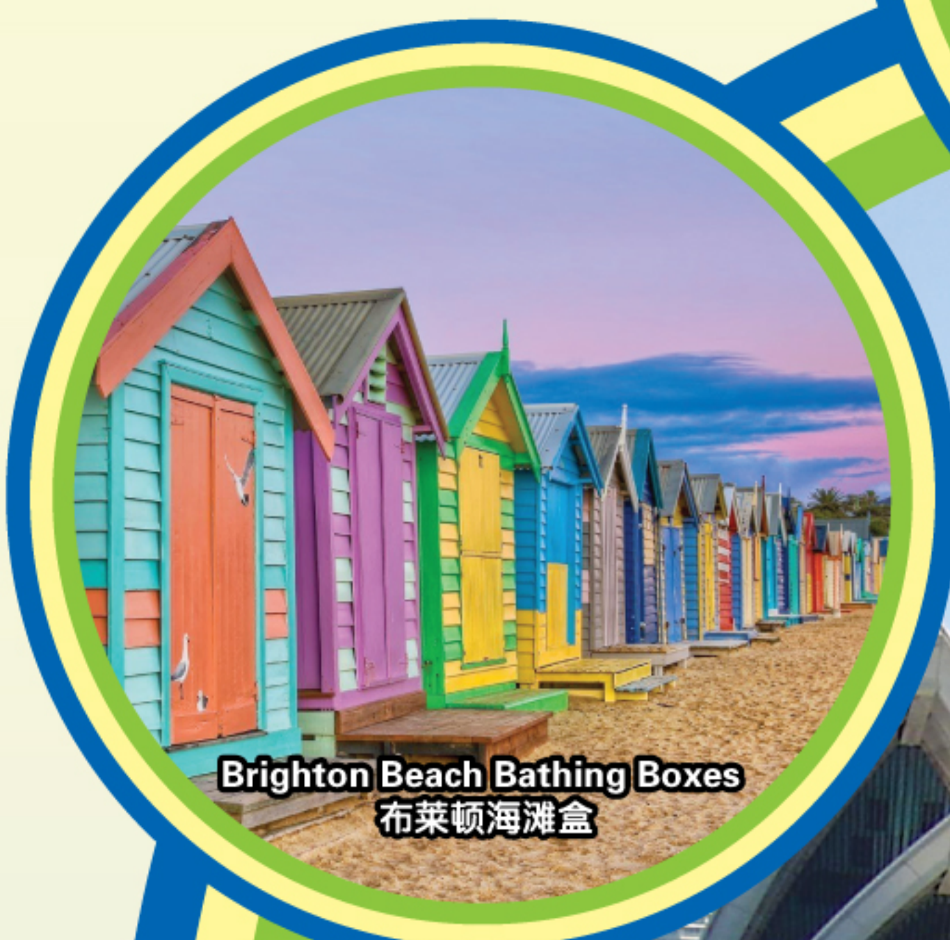
Brighton Beach Bathing Boxes 布莱顿海滩盒