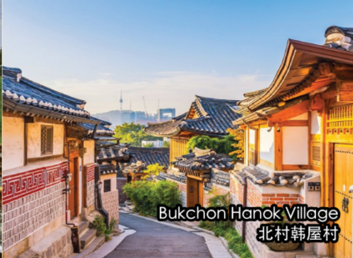
Bukchon Hanok Village 北村韩屋村