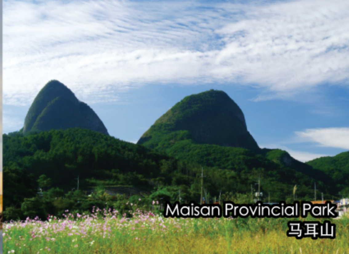
Maisan Provincial Park 马耳山