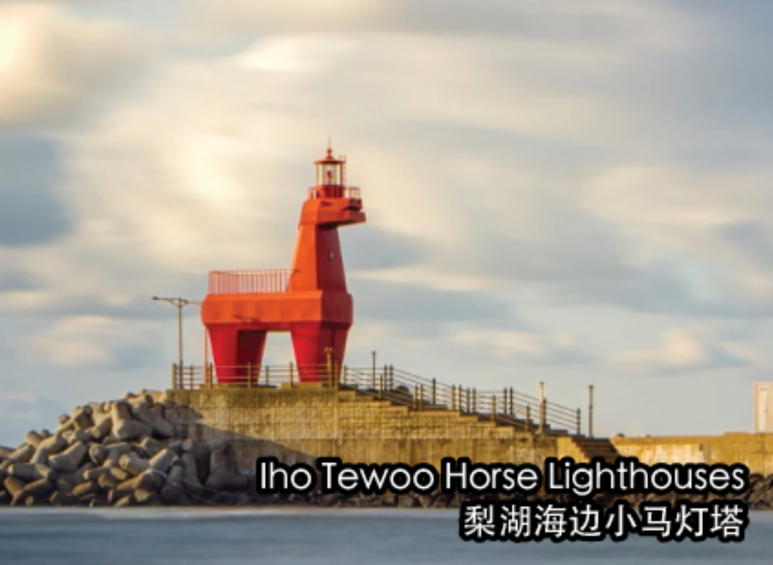
Iho Tewoo Horse Lighthouses 梨湖海边小马灯塔