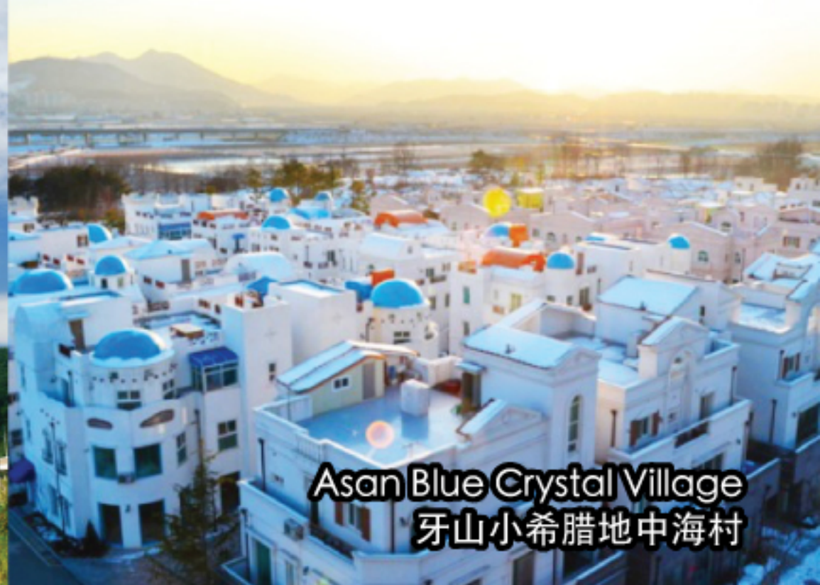
Asan Blue Crystal Village 牙山小希腊地中海村