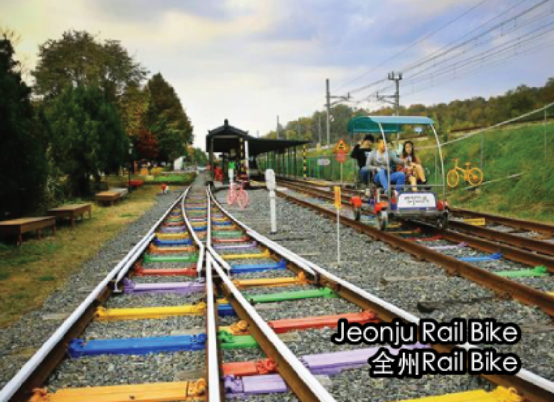
Jeonju Rail Bike 全州Rail Bike