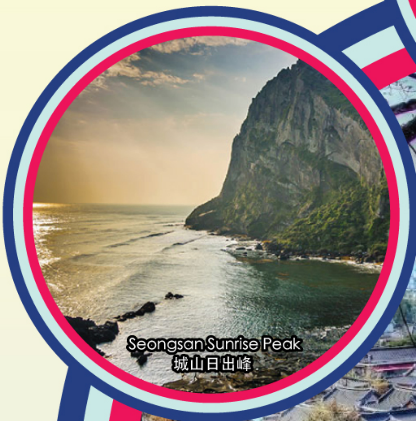
Seongsan Sunrise Peak 城山日出峰