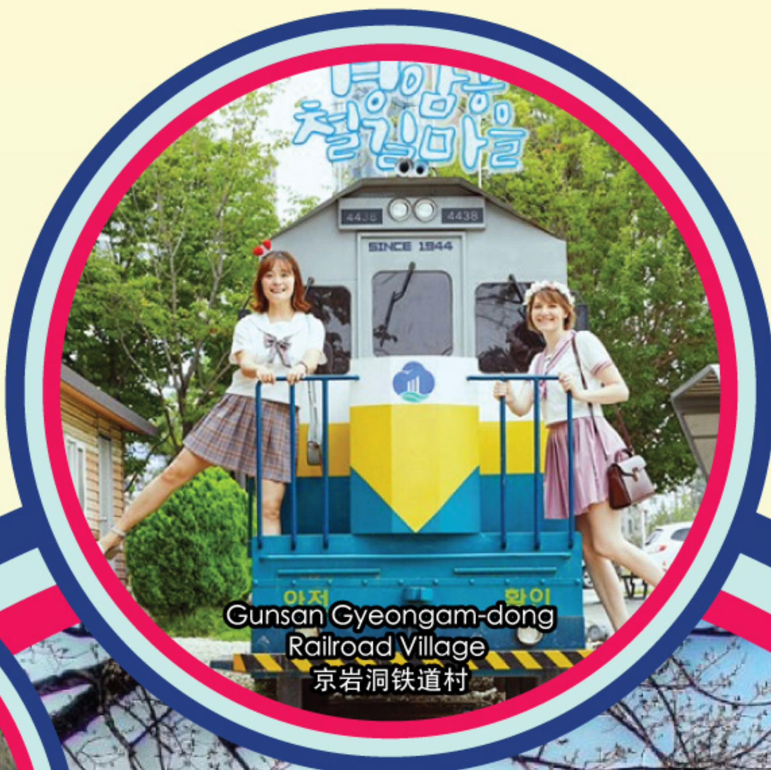
Gunsan Gyeongam-dong Railroad Village 京岩洞铁道村