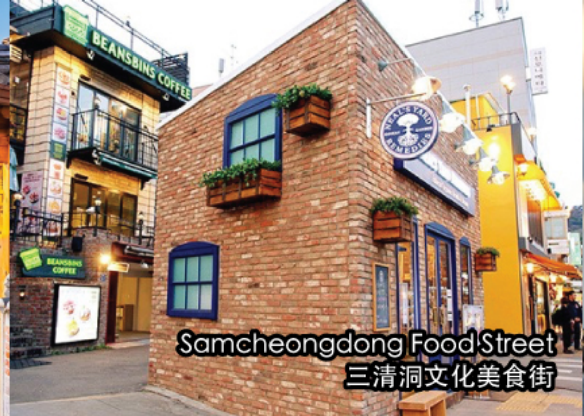
Samcheongdong Food Street 三清洞文化美食街