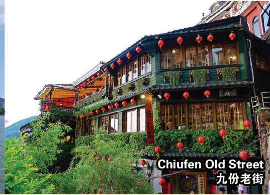
Chiufen Old Street 九份老街