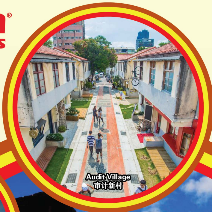
Audit Village 审计新村