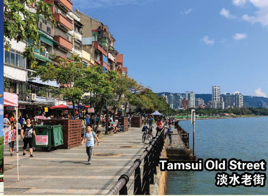
Tamsui Old Street 淡水老街