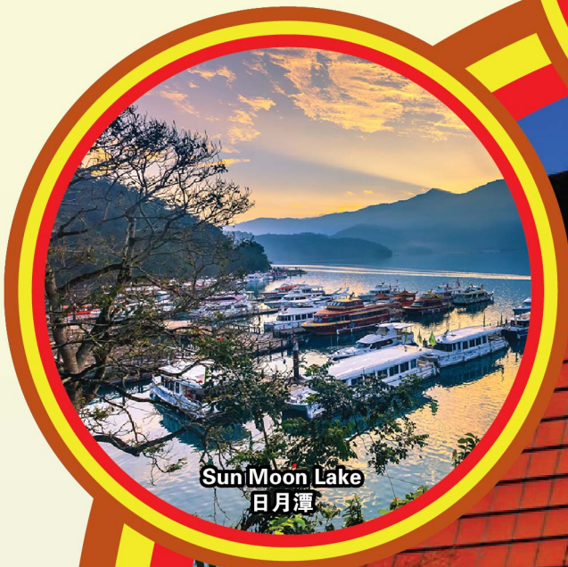
Sun Moon Lake 日月潭