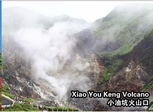
Xiao You Keng Volcano 小油坑火山口