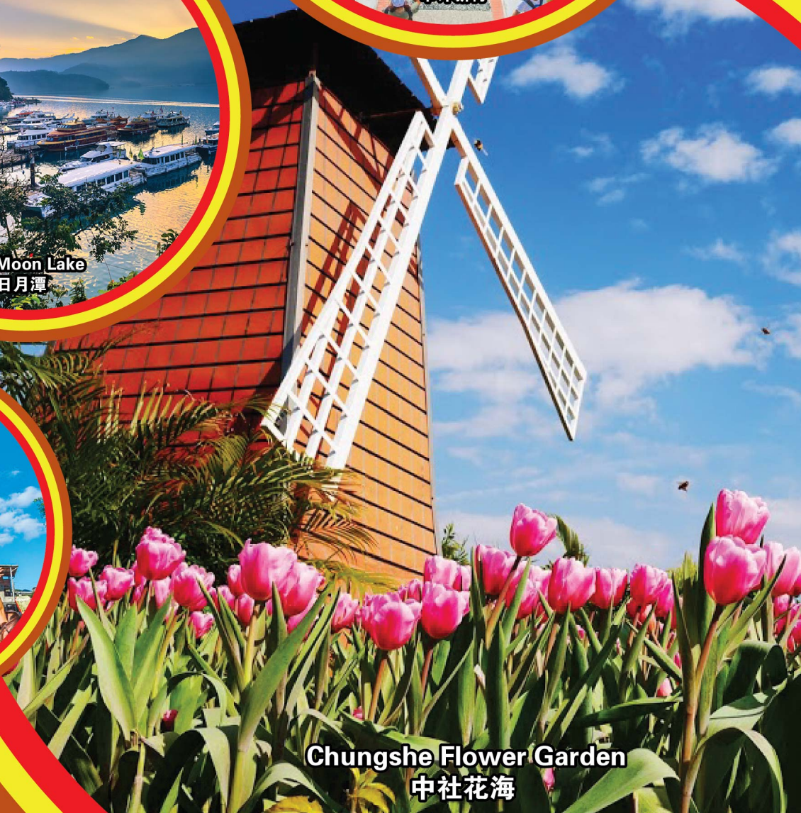
Chungshe Flower Garden 中社花海

行程次序·以当地旅社安排为准。 Sequences of Itinerary are subject to local arrangement.