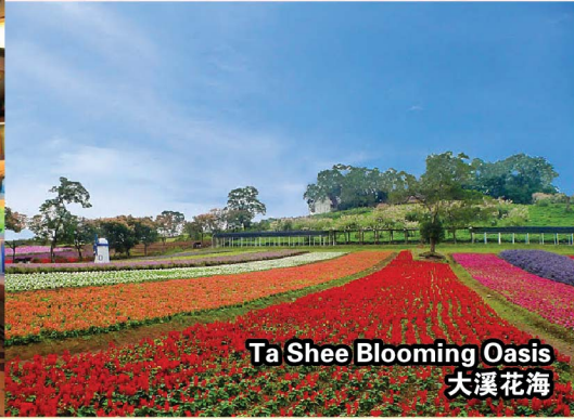
Ta Shee Blooming Oasis 大溪花海