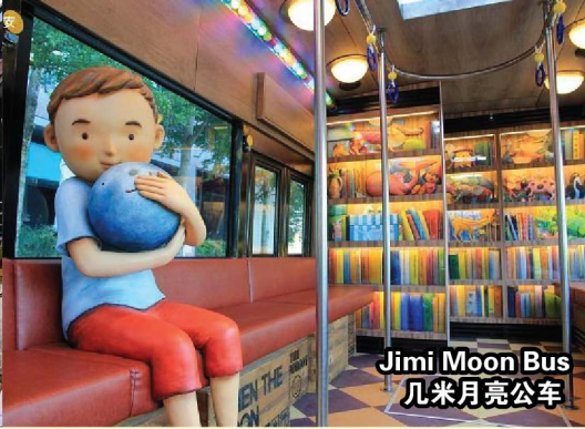
Jimi Moon Bus 几米月亮公车